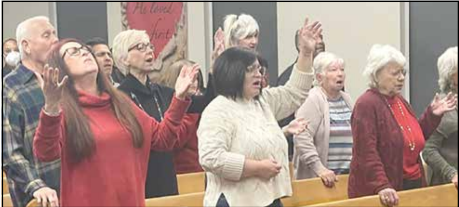
The event brought together the community to pray in harmony.

The best part for her was the prayer and worship.