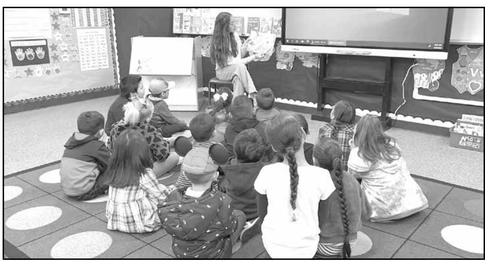
Students listen and learn as volunteer readers entertained them.

There were a variety of books read at the schools, from numerous Dr. Seuss books, to other popular childrens books that entertained the kids as well as shown what a positive activity reading can be.