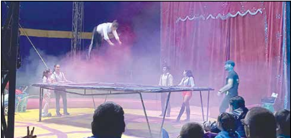
The troupe performed a number of tricks on the trampoline.

In between the tricks and high-flying members of the team, the clowns kept the audience laughing and involved in the action. A balloon was batted around the big top, with the clowns encouraging the crowd to keep it up in the air, until a clown with a bad attitude popped it, causing the crowd to boo him off the stage. It was a real crowd-pleaser.