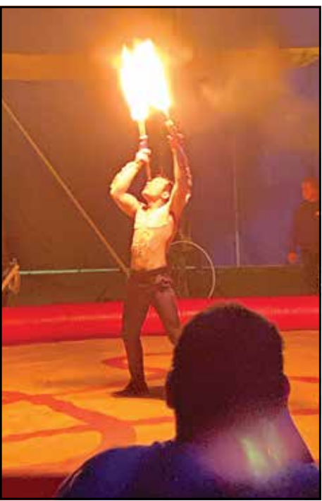
The juggler kept flaming objects in the air.

This circus had a host of different acts