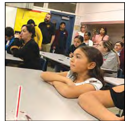
One of the classrooms where the competitions took place.