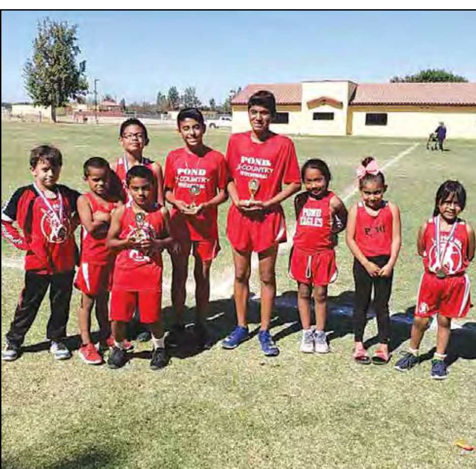
A majority of the Pond Running Club members are headed to the Junior Olympics.