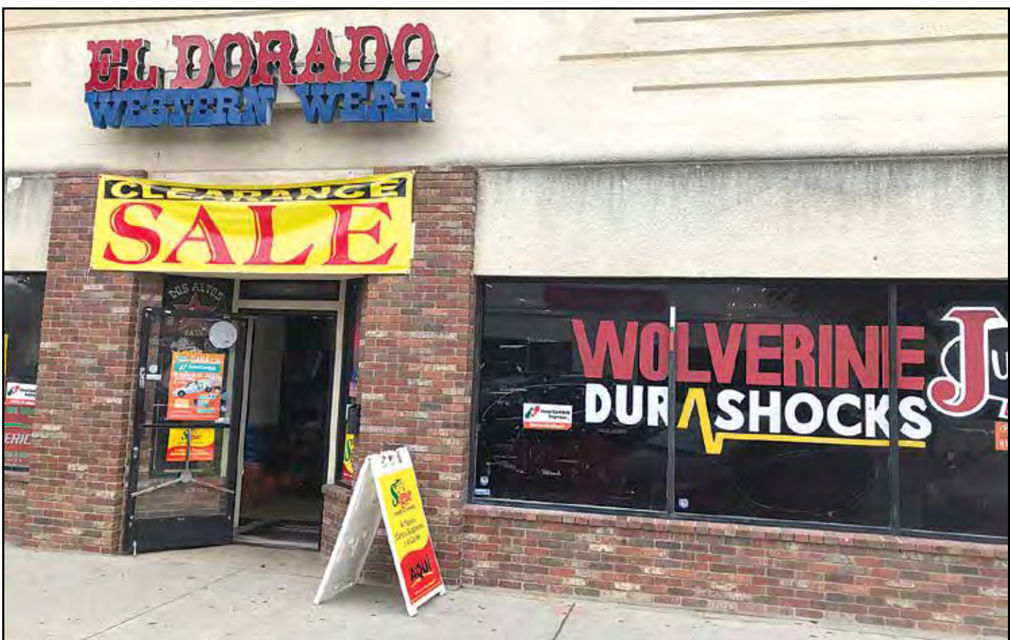
El Dorado will be celebrating 20 years of business in May.