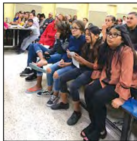
TJ's cafeteria was standing room only during the district's oral language festival.