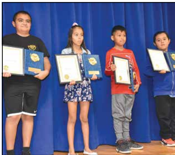
TOP: Group 2 students either met or exceeded standards in either math or ELA. MIDDLE: Group 3 students that met or exceeded standards in both ELA and math. BOTTOM: Group 1 students showed growth in either ELA or math. RIGHT: Group 4 students who exceeded standards in both ELA and math.