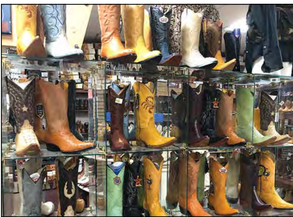
There is a great variety of boots and western wear in the store.

kid was a baby. "I love this store. It has a lot of the stuff that you find in the big stores in Bakersfield. I