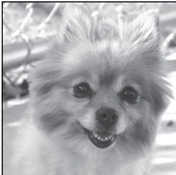
Visit Jazz at the Wasco Animal Shelter. She will be available Dec. 10.