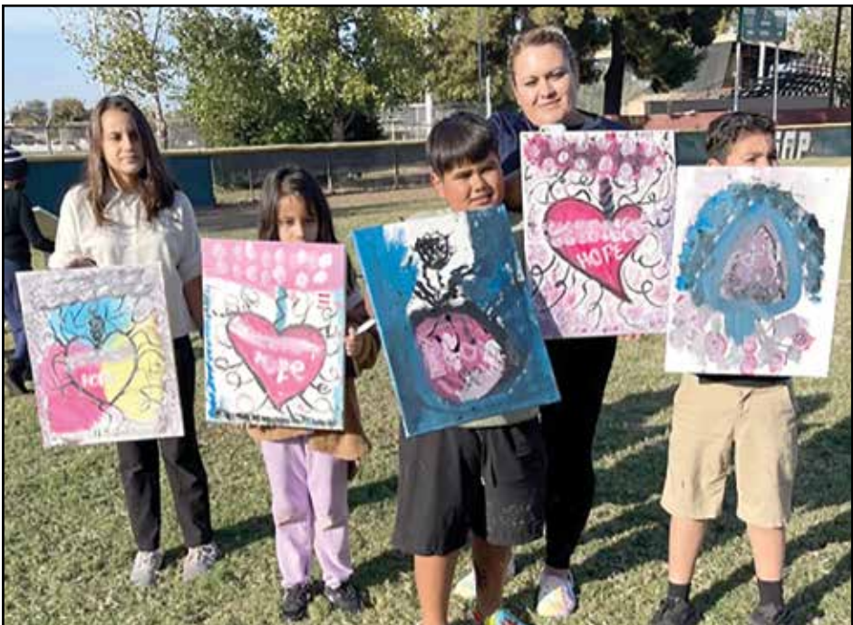
A group of five having fun and experiencing making art for the first time as a family.