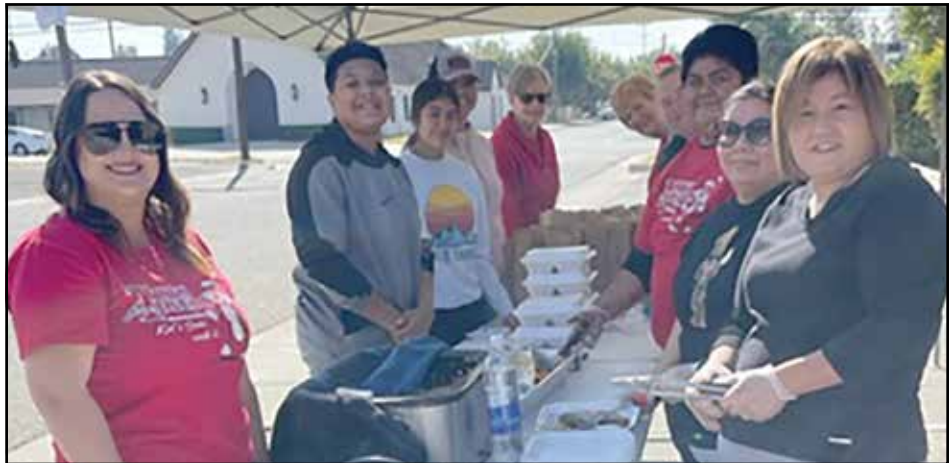
Toys for Tigers volunteers helped prep and distribute the chicken meals.

"I think of a child on Christmas morning