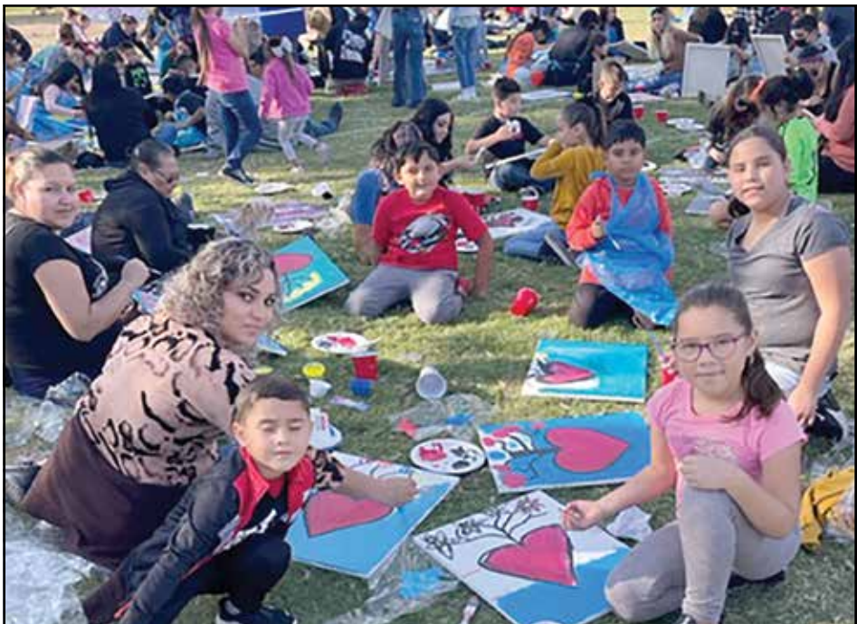
The family painting party drew a large crowd.