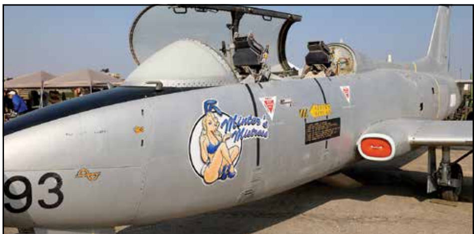
The event will feature a variety of vintage airplanes.