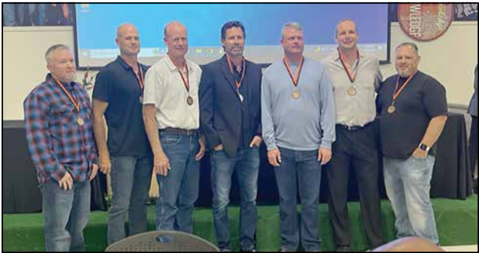
1990-1991 varsity boys tennis team.