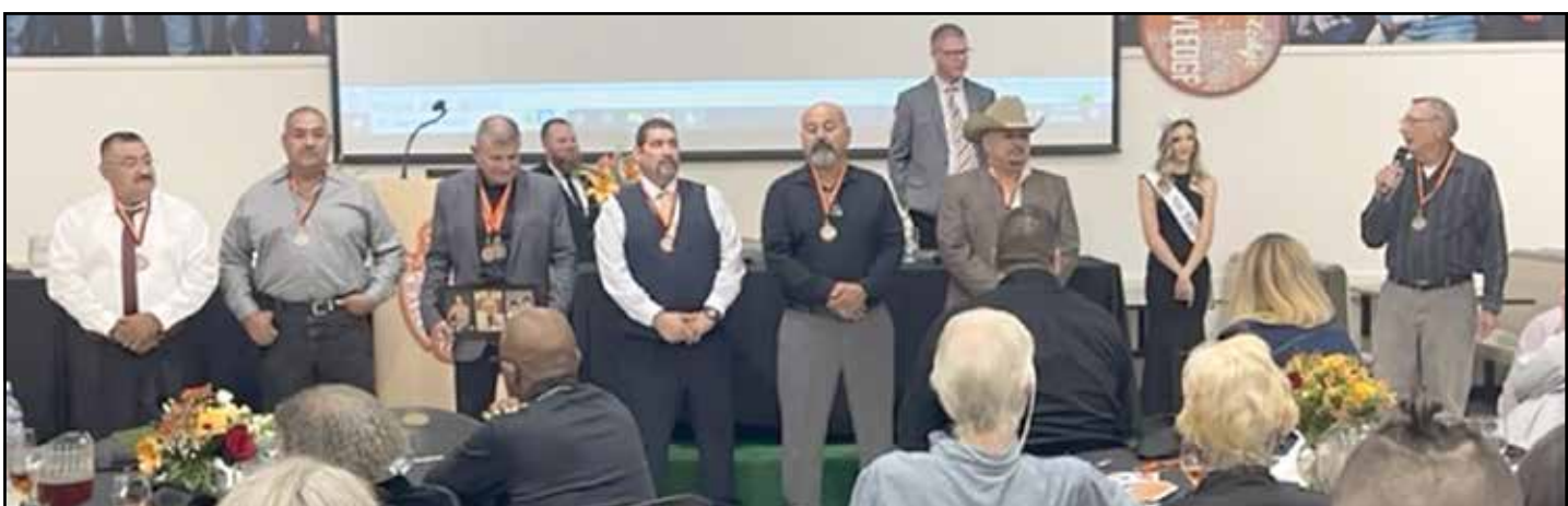
1985 varsity boys cross country team.