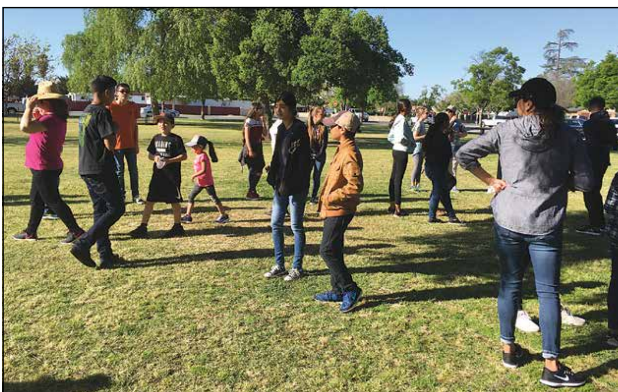
Volunteers began arriving at Barker Park around 8:30 a.m.