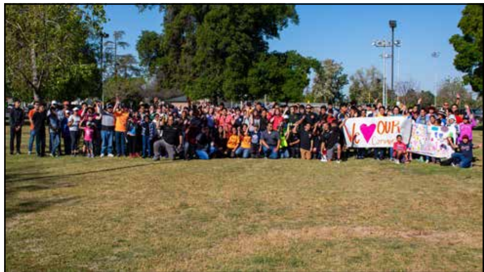
A panoramic view of the entire group of volunteers.