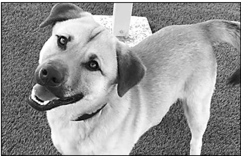
Tarzan is a male German shephard

If you want to play with Tarzan, visit him at the Wasco Animal Shelter, 5409 7th St., or call 661-758-7240.