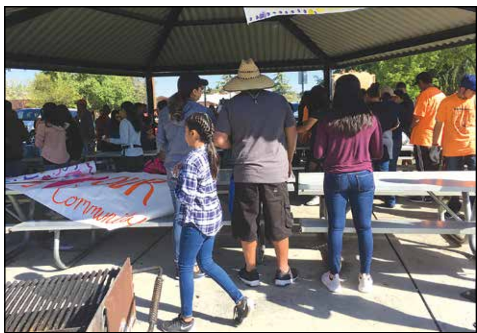
Volunteers getting ready to break for lunch.

Blue Sushi open its doors early to donate teriyaki chicken bowls for lunch for the volunteers.