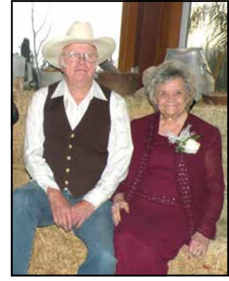
Enjoying a western barbecue a few years back.