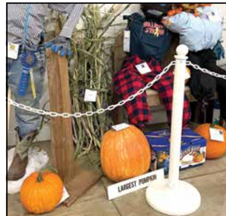
Judged the largest pumpkin submitted to the 2021 Kern County Fair.