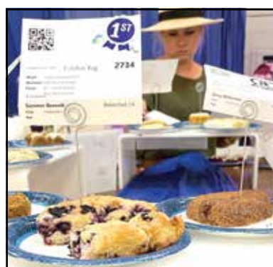
First place baked goods.

The numbers of entrants in the cooking/baking/demonstration booths were also limited. Some canned and preserved food items were visible at the fair, but not in either of the buildings viewed.