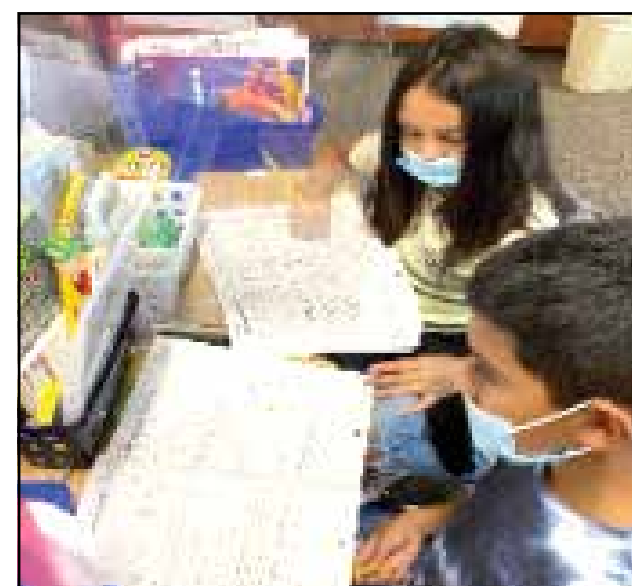
The students discussed how there are heroes in our everyday lives.

Sentence frames were what was used to support students with a focus on their English Language Learners.