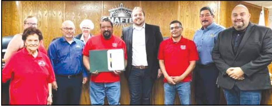
The Shafter City Council with the Shafter Cinco de Mayo Committee.

Currently, the property technician is filling these duties, which takes a lot of