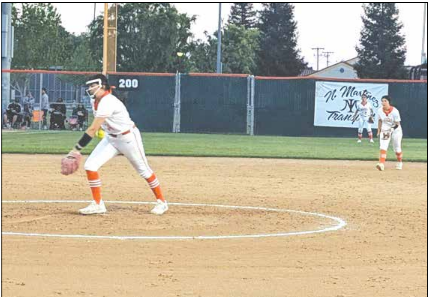
The WHS Tigers softball team lost to Taft on Tuesday but is poised for a comeback against them on Thursday.