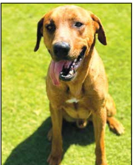
Chance, a honey-colored Labrador, is one of several dogs available for adoption.