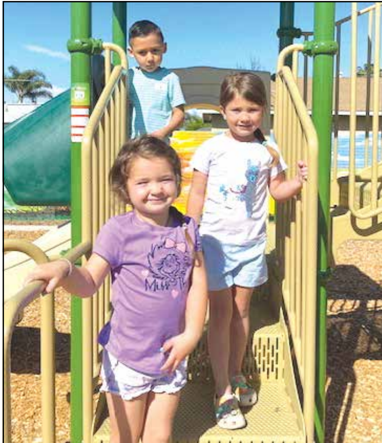
Children enjoying the new jungle gym.