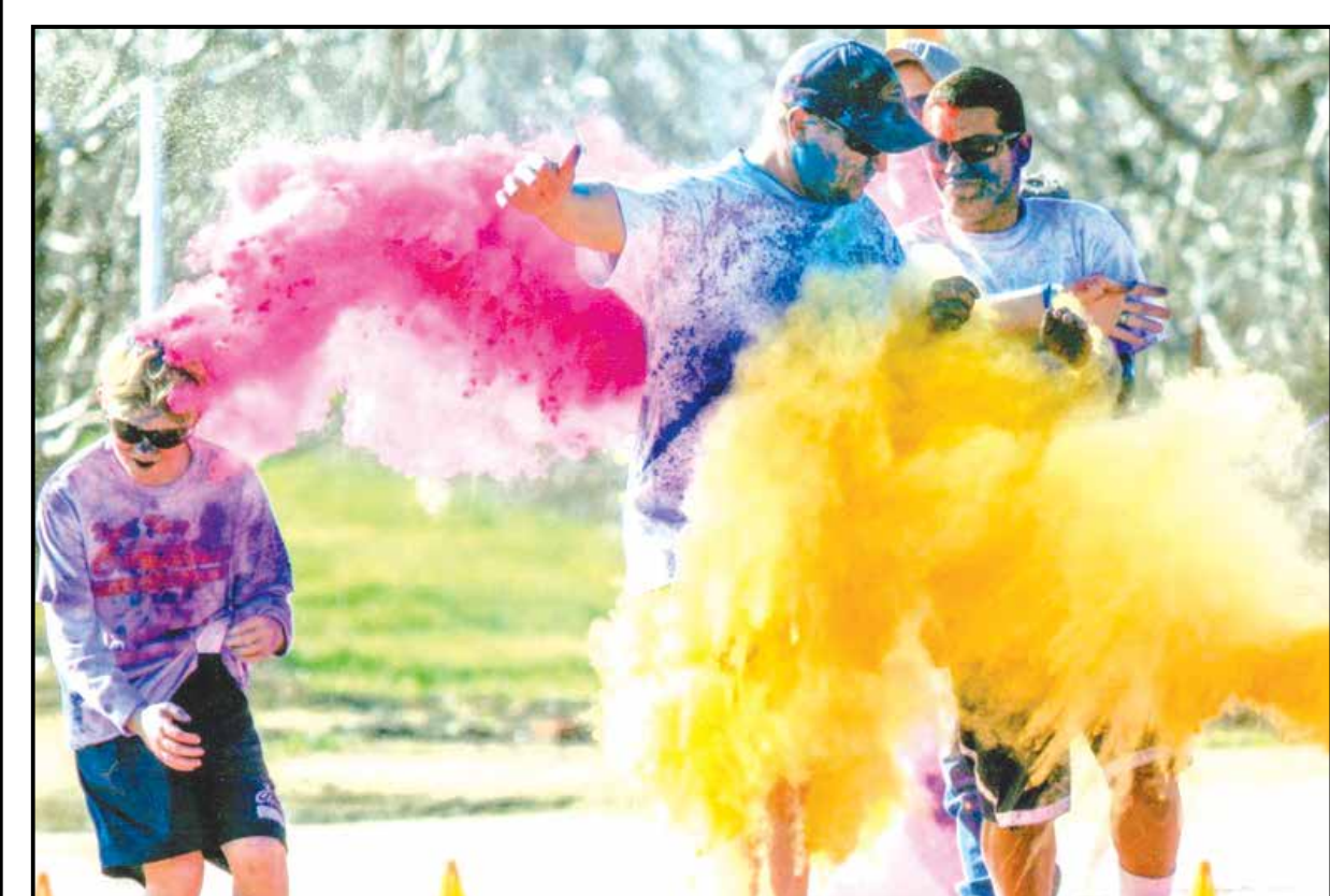
The popular Colours Fun Run will be held on Saturday morning.