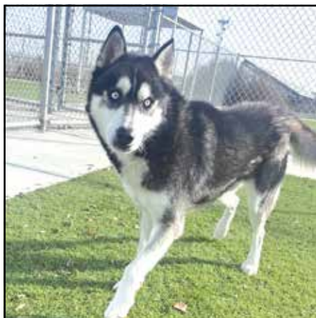
Huskies are among the most common breeds found at the shelter.

"This is where we inform the public and the rescues (503(c) nonprofit organizations that can pull from the shelters) that dogs