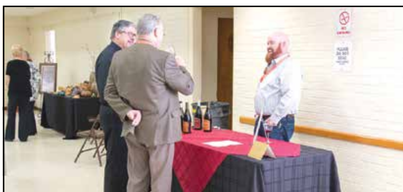
A Meet the Artists and Wine Tasting event returns.