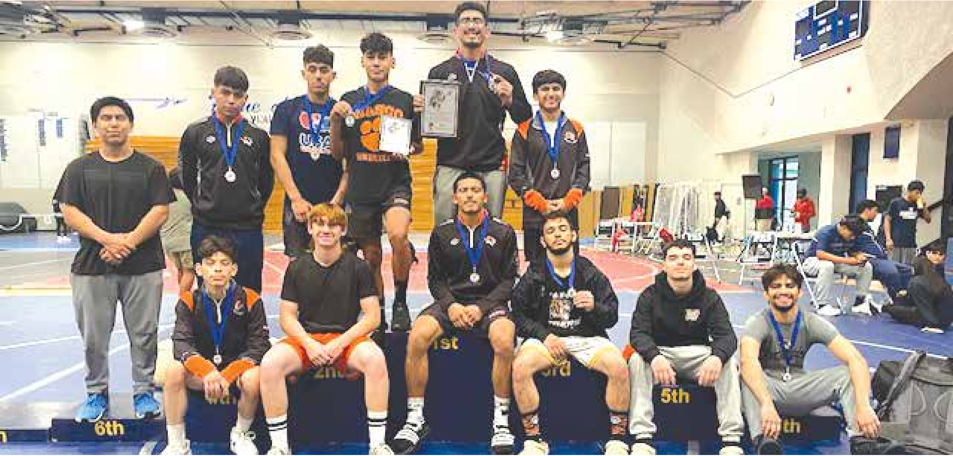
The WHS boys varsity wrestling team at the Bash Tournament in Farmersville, where they took home first place.