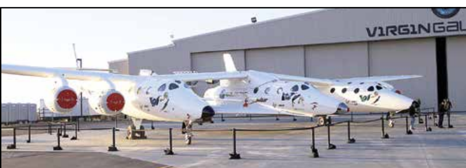
These aircraft are the future of space travel.

Virgin Galactic has put civilians into space for a 90-minute journeys. Passengers experience minutes of weightlessness as the craft soars through space, giving the passengers the experience of a lifetime. Their ultimate goal is to make it commercially feasible for people to travel into space regularly. With the successful ventures into space that have been completed, they are getting closer to this goal and hope to have the future for spaceflight within its grasp.