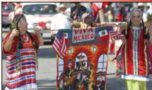
Walker Senior Center residents were in traditional dress, dancing down Central Avenue.

USDA Prime - USDA Choice - Seafood - Wagyu