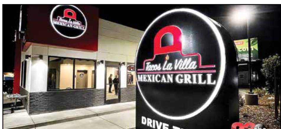
The former Del Taco should be opening soon as a Tacos La Villa.

at 99 cents all day. Another popular item is their Hot Cheetos Burrito.