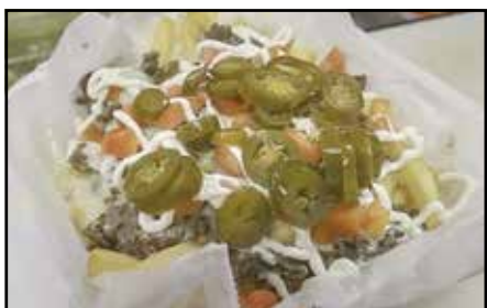
The asada fries are a specialty of Tacos La Villa.

Tacos La Villa are famous for Bakersfield Famous Tuesdays, pricing their tacos