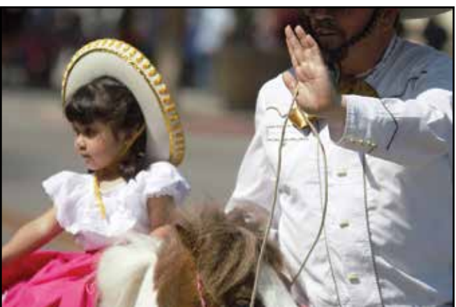
The parade included several horses and riders, including this Shetland pony.