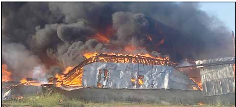
The shed on Lerdo Highway was burned down to the ground.