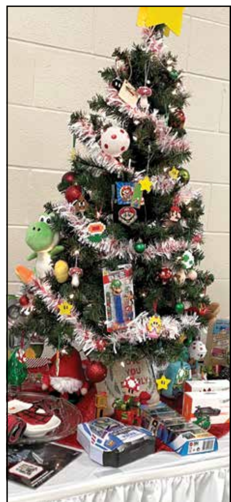
One of the many Christmas trees at Holiday Splendor.