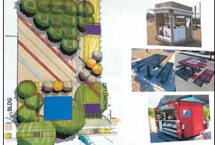
Exhibit 2 demonstrates an optional element for Parklet A.

Exhibit #3. The concept plans for 7th Street Park highlights the following: Trees are strategically placed so they are not directly in front of any business doorways. Sidewalk paving treatment is strategically designed to be low maintenance and to guide pedestrians and shoppers to the front