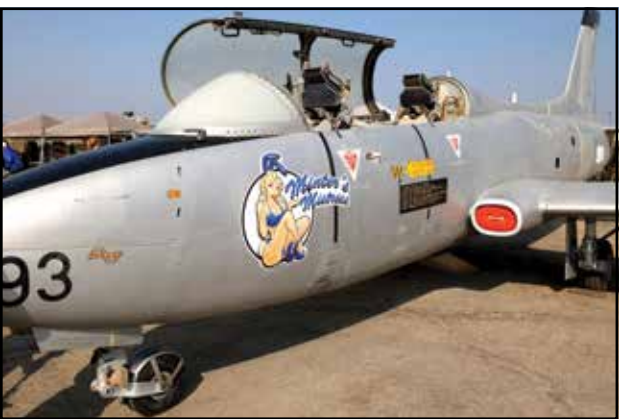
This plane stirs memories of a bygone era.

show at the site, drawing everything from antique cars, modern sports cars, to military vehicles and tractors. There was also a variety of food at the event, as well as vendors selling everything from pet supplies to baked goods.