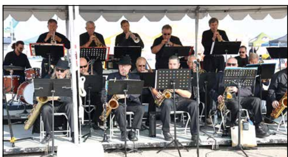
Some of Shafter’s musicians were on hand as part of the Shafter Big Band.

In addition to the assortment of aircraft on hand, the museum also had a car