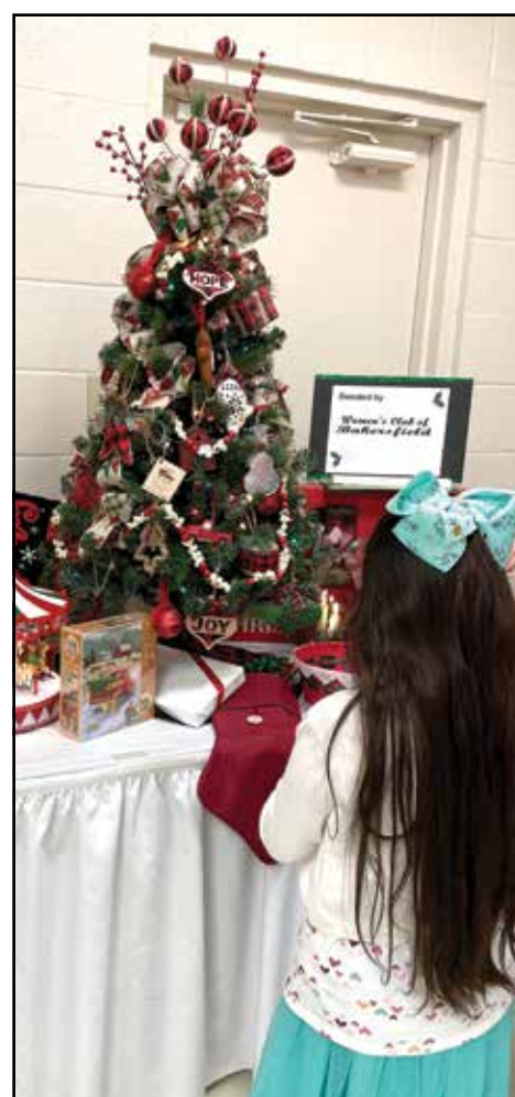
One small shopper gazed longingly at the kids' tree.