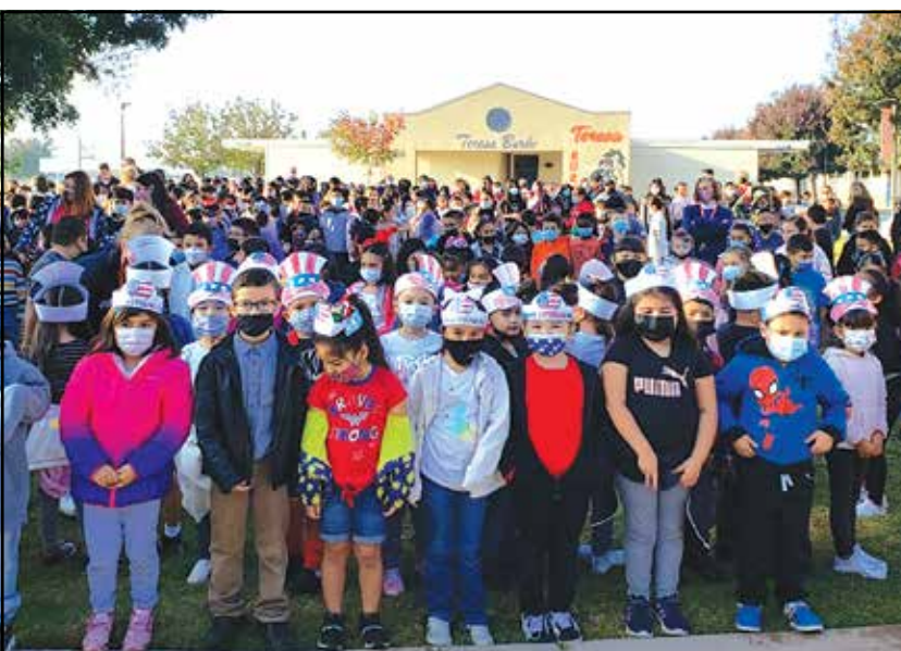
Students were lined up on the grassy area for the program.