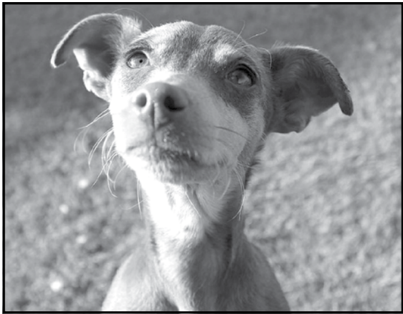
Ryder is a miniature pinscher-mix puppy.