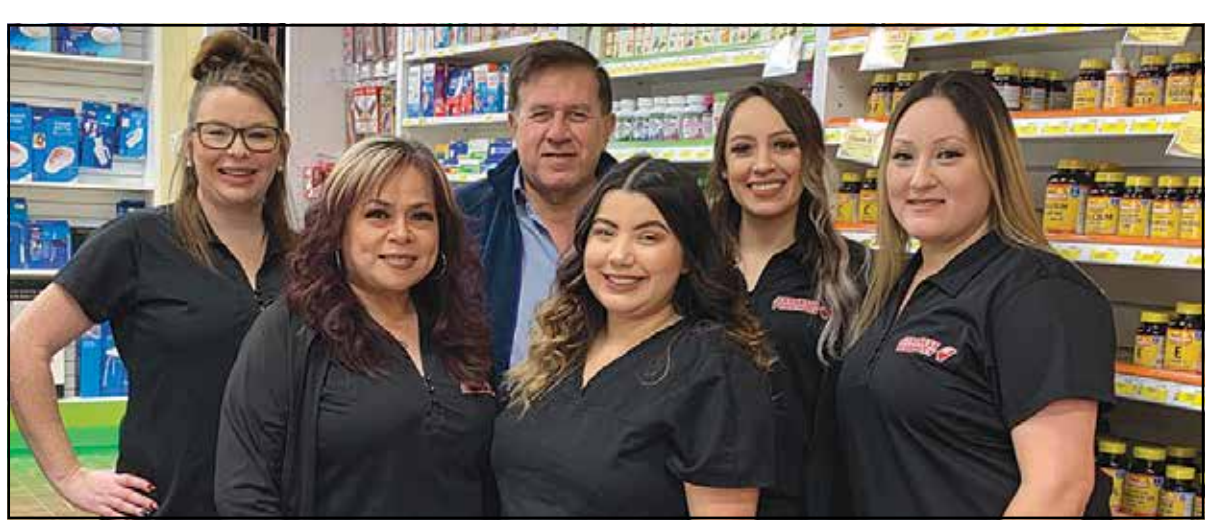
The Wasco staff of Express Pharmacy.