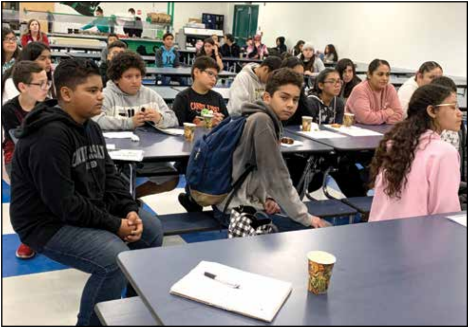
The cafeteria had about 30 November Students of the Month.