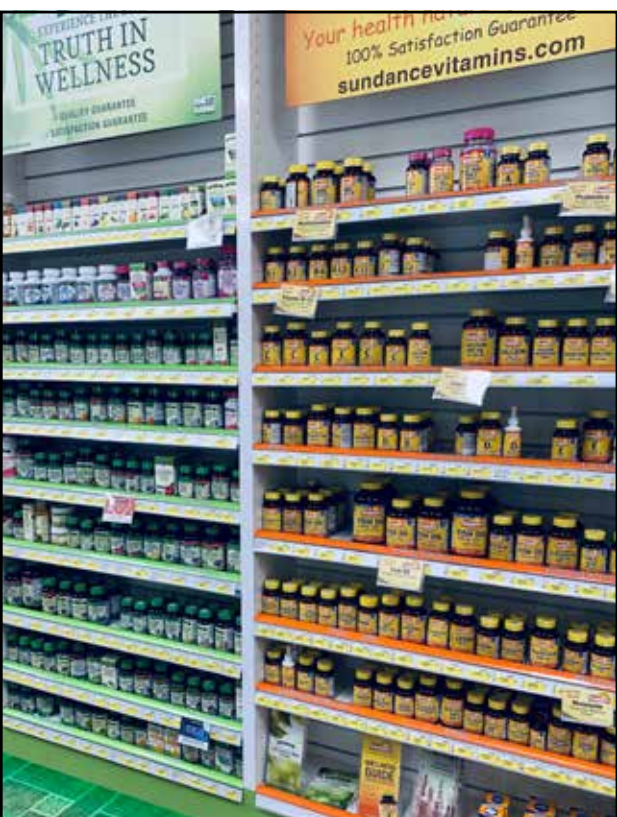
Vitamins and herbal supplements are also available at the pharmacy.

"When people drive by the Wasco location, the first thing they notice is a large rock jutting out of the sidewalk in front of the pharmacy," Hussein said. "The previous owners, the Clarks, placed a bench so people could sit and wait outside -- until a [real creepy-looking] clown took over the bench