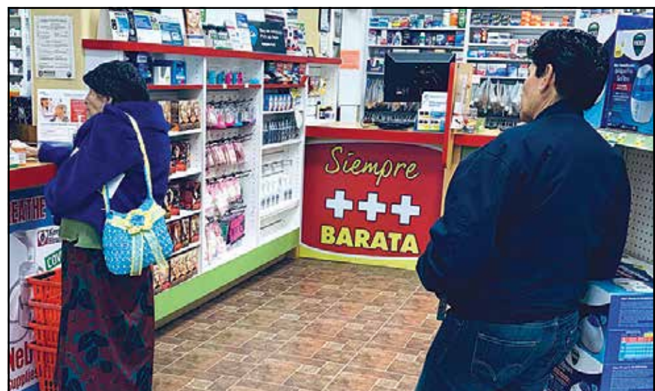
Customers served at Express Pharmacy.

and scared children. The city then removed the bench."