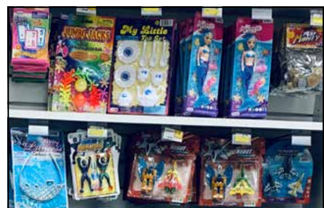
Kids' toys fill shelves.

Both pharmacies are well stocked with various sundries, makeup and pharmaceutical items, such as vitamins, orthopedic aides, feminine hygiene products, hair brushes of all types, small toys for children and even hair-dyeing kits.