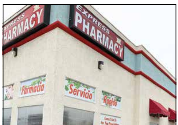
Express Pharmacy located at 650 F St., Wasco.