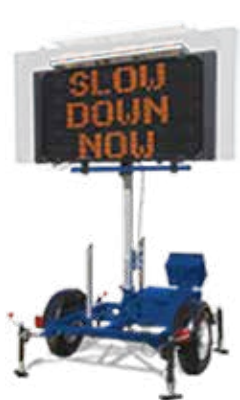
City will purchase radar sign like this.