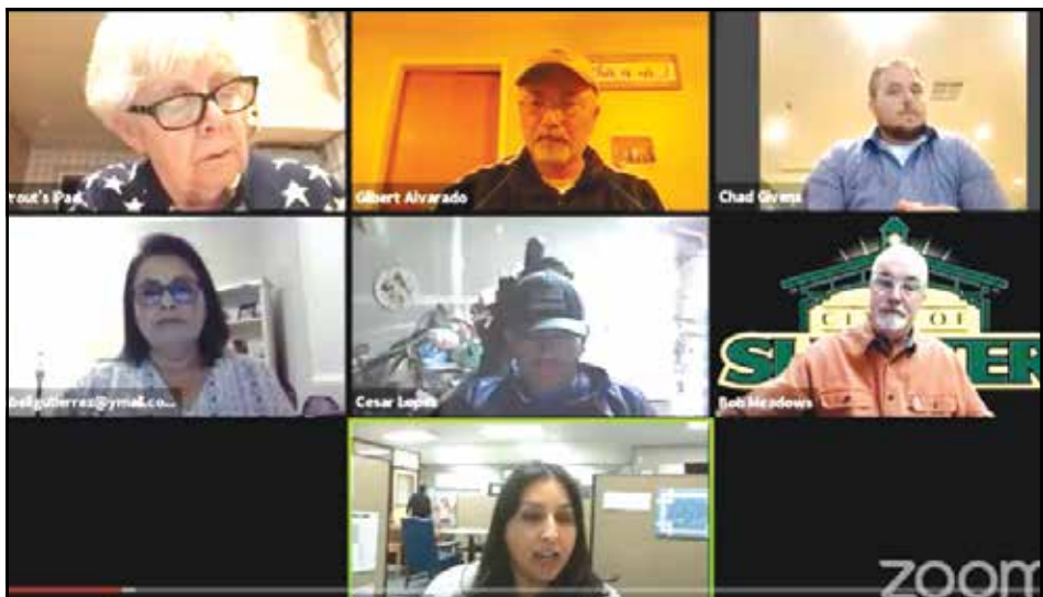
Council discusses possible change in way the mayor is selected.

There is not a time or place for the event as of yet, but the event will be supported by the city with in-kind services, such as waiving of fees, logistic support and policing.