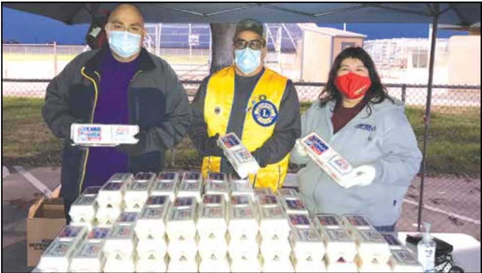
Shafter Lions Club was just one of the organizations that took part in the event.

SHAFTER the usual holiday events, residents had to find ways to celebrate the holiday. An example of Thanksgiving spirit was the event held at the Shafter Recreation Department in which 100 families were able to shop in the Recreation Department’s parking lot to gather ingredients for a complete See EVENT Page 6