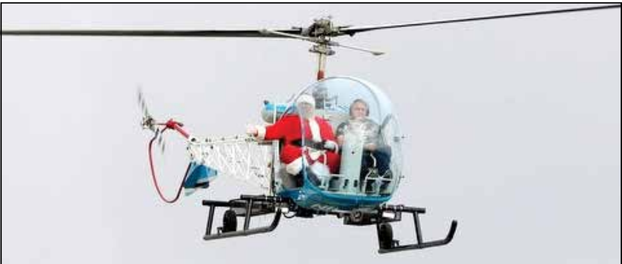
Santa touches down at last year's event.

The event is free. Drive out to the airport at 11 a.m. as Santa will be arriving on a classic helicopter, putting smiles on all of the children's faces, and spreading that Christmas spirit.