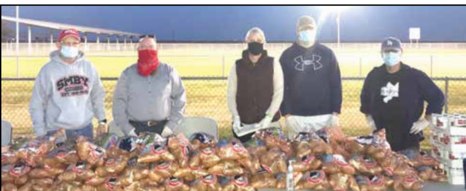
Shafter Mennonite Brethren Church was handing out bags of potatoes.