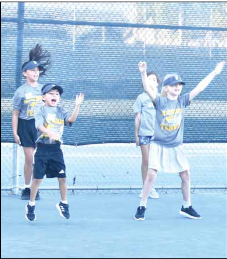
Conditioning is an important part of the sessions.