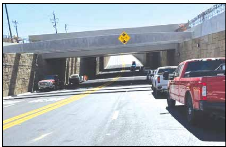
The Poso Avenue High-Speed Rail underpass will improve traffic and pedestrian mobility.