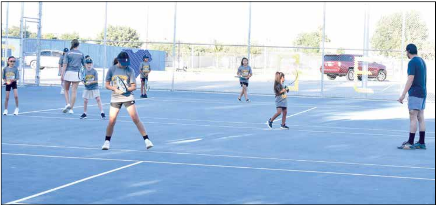
The campers learn proper footwork.

The campers spent several drills practicing how to shuffle sideways, enabling them to correctly be in the proper position to approach the ball. This phase of the game is often overlooked, with eager players wanting to get out there and hit the ball immediately. "A lot of the kids we have haven't played the game before," Sa-