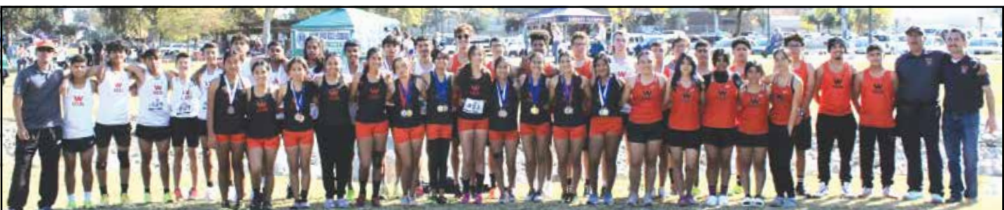
Coaches with the WHS 2022 cross country team.