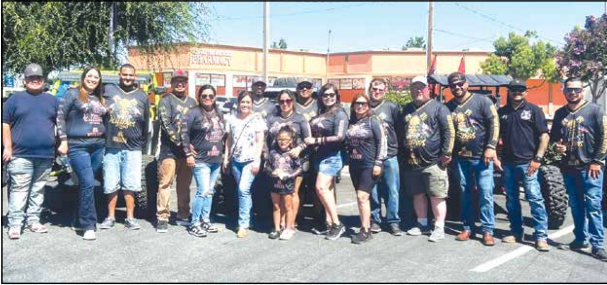
Members of Acelerados Offroad pose with a couple of their all-terrain vehicles that were on display.

of offroad vehicles. There were over a dozen all-terrain vehicles in the parking lot, giving the kids in attendance a thrill as they checked them out and sat in a few of them. The event has been helping the district for over five years, each year getting more supplies added to the generous haul enjoyed by the kids who might not have enough paper, pencils, or even a backpack without some help. "We want to thank the community, as well as the sponsors with us for the success of this event. The big winners are the kids, who will be able to begin the school year without worry." The distribution will take place before the school year begins and will include all five of the Richland schools.