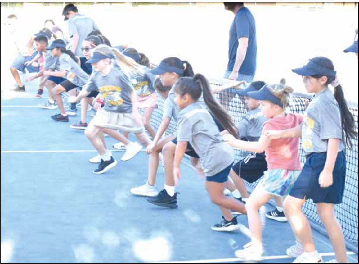
Wind sprints help with the group's quickness.