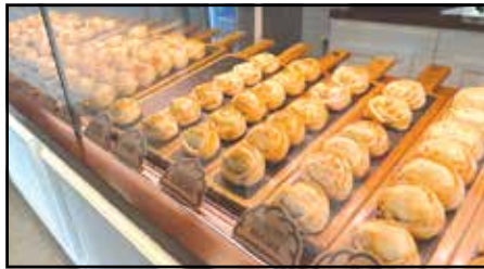
Empanadas are everywhere in Spain.

She said that for other services, she charges nominal fees that are "very com-