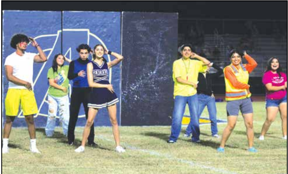
The Seniors present a skit about the Marvel Comics super heroes.

"These kids do a lot of work and are so great at what they do. We re-