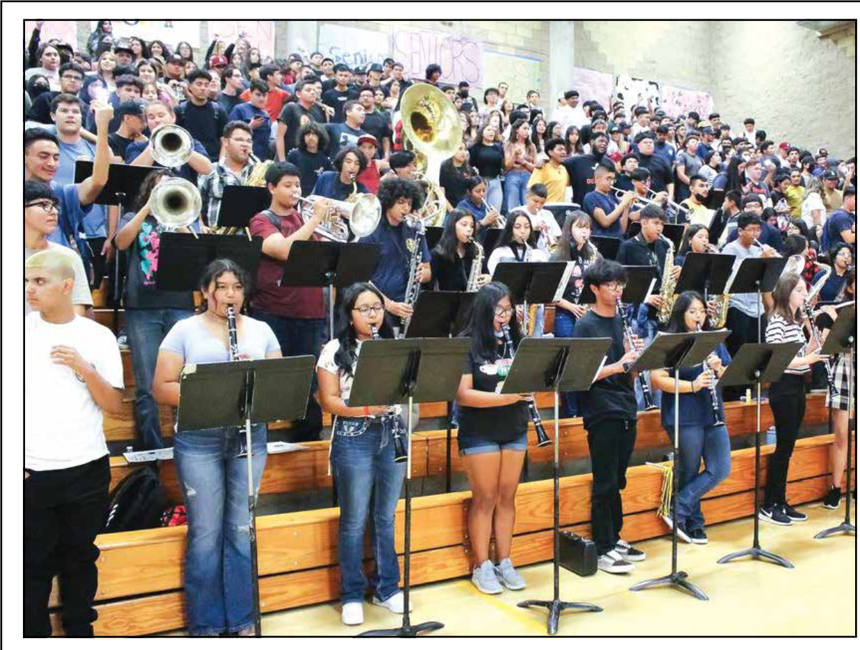
The Shafter High Band gets the students in a celebratory mood.