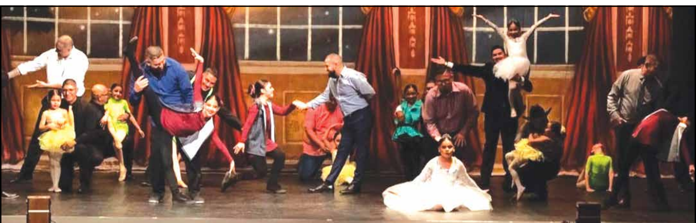
Daddy-daughter dance at the 2021 'Once Upon A December' recital.