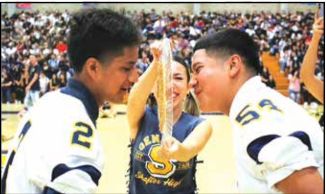
Games were a big part of the Homecoming Rally.

presented a skit at midfield with a Disney theme. The freshmen chose to do a depiction of the Mickey Mouse clubhouse, with a lot of dancing. The sophomores did a play off of "Star Wars," including light saber fights and effects. The juniors did a skit on the Incredibles, with a ton of dancing and sweet moves.