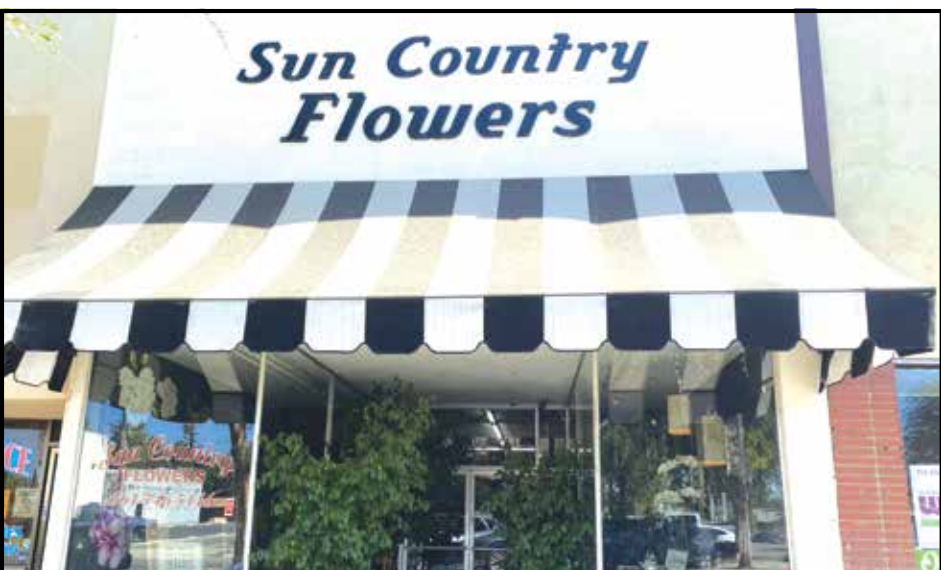
Sun Country Flowers offers a variety of plants and other items.

been growing her own flowers for a few years now. Kirschenmann started her own business a couple of years ago, growing flowers and plants and selling them online and in different spots around town, includ-