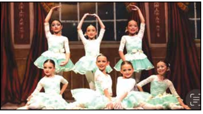
Dancers in their custom-made costumes at the 2021 'Once Upon A December' recital.

Tickets for Sleigh Ride are $25 and can be purchased at the studio, 641 F St. Monday through Thursday from 4 to 9 p.m. For more information, call 661-240-5924.