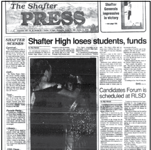
The front page, Oct. 14, 1992.

30 years ago: Oct. 14, 1992 Shafter Public Works moved from its James Street location to the newly renovated City Hall at the Old Shafter Courthouse on 336 Pacific Ave. 40 years ago: Oct. 20, 1982 Shafter and Wasco High football teams infamous rival games were almost a half a century in. Shafter High with 26 wins and Wasco High with 25 wins were on the record in 1981. Compiled by Erica Soriano