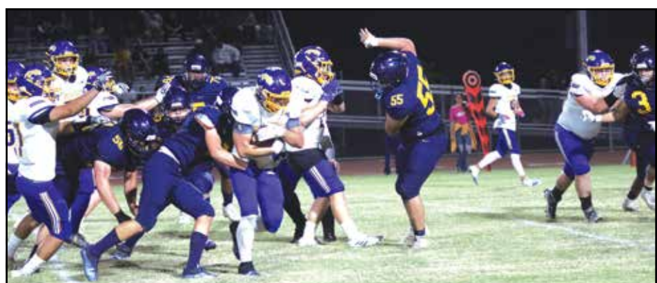
The Generals' defense stop the Wildcats on third down in the first half.

But, in a repeat of last week's game, the Generals' defense allowed the Wildcats back in the game, allowing three scores in the third quarter. Shafter didn't make one stop on a series in the third quarter, letting Taft score on three straight possessions. This was due to poor tackling, blown coverages, and not being able to control the line of scrimmage.