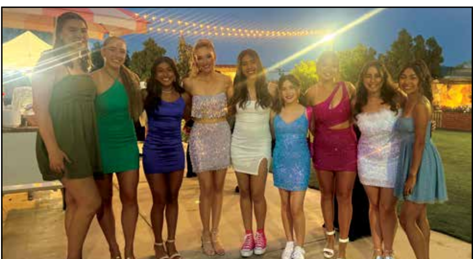
Girls wore beautiful dresses.