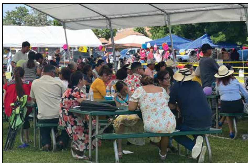
Community members enjoyed the music.