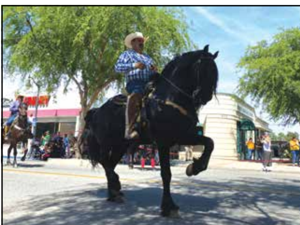
The high-stepping equines were a highlight of the parade.