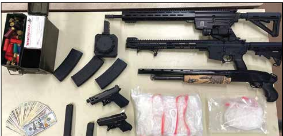
Weapons, ammunition, cash and drugs were found at the Faber Street residence.