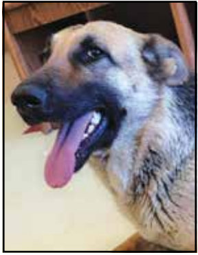
According to shelter staff, Sage has passed all

Sage is also a very smart and curious dog, who will make you laugh and can also keep up with you as an active person. Sage is very active and would do well in a home with a little room to run around and also a tall fence to keep her safe.