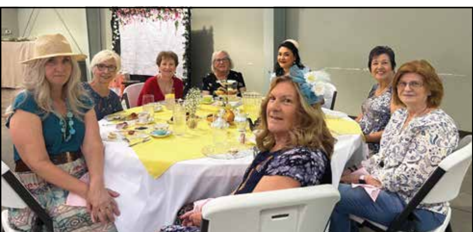
Guests enjoyed the fellowship and socializing.