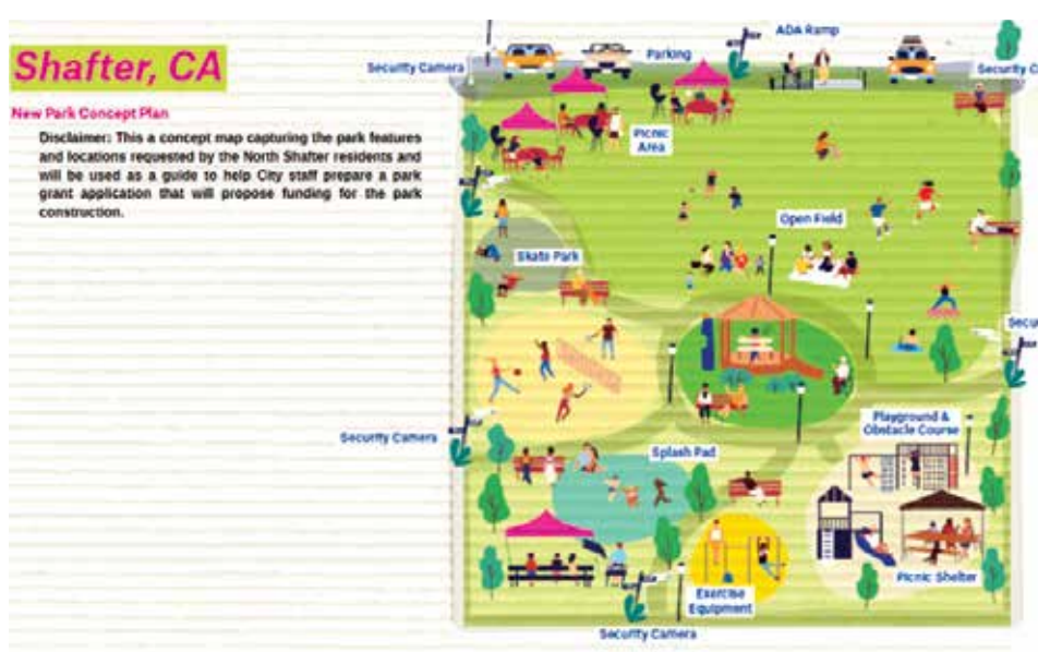
These plans for a proposed park in North Shafter to improve the quality of the air, as well as the safety of its residents and children.