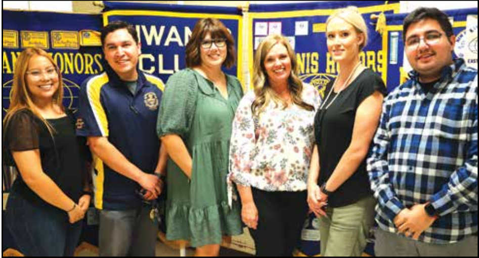
The new teachers at Shafter High.