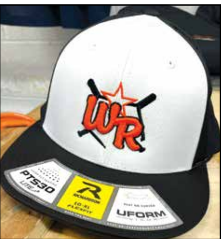
Wasco T-Shirts specializes in custom embroidery, as seen in this hat.