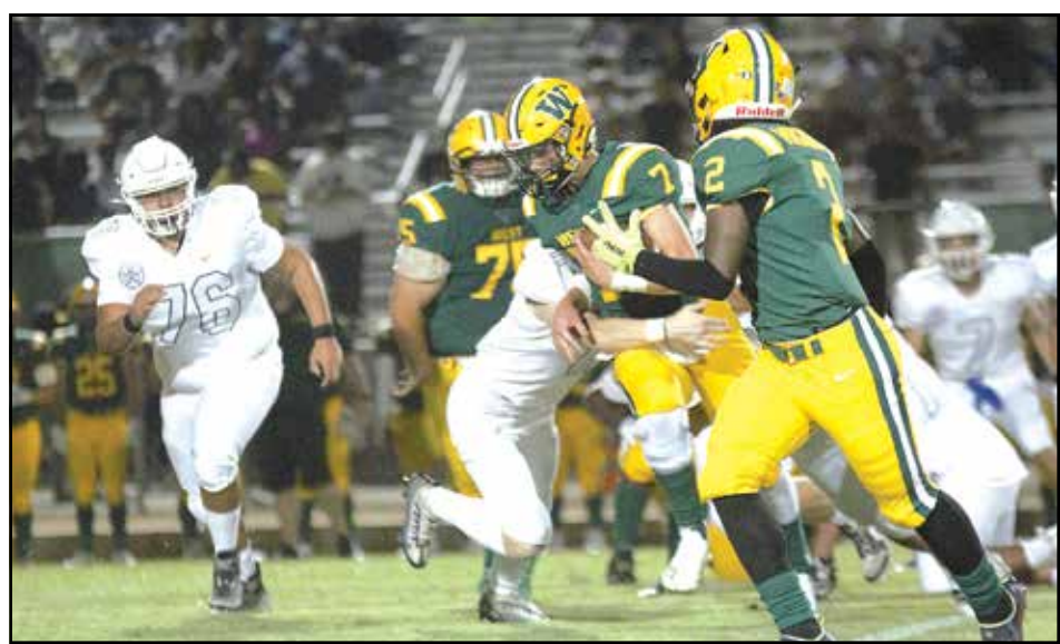
The Generals' defense swarmed the Vikings' backs and receivers.