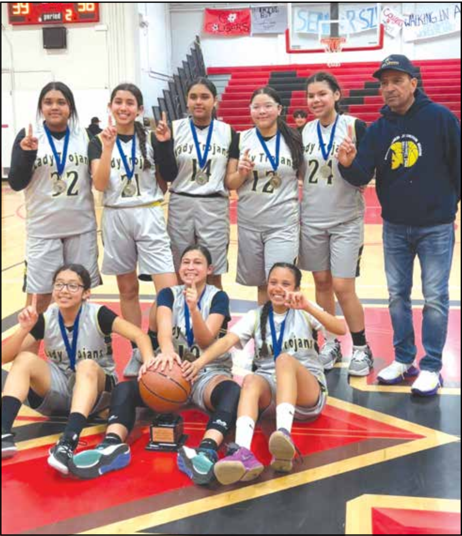
The 8 th Grade team went 24-1 for the season.