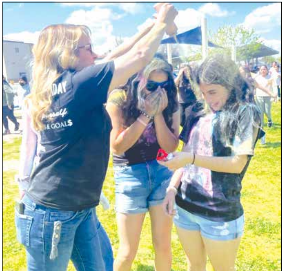
Students were thrilled to be dusted with colorful powders.