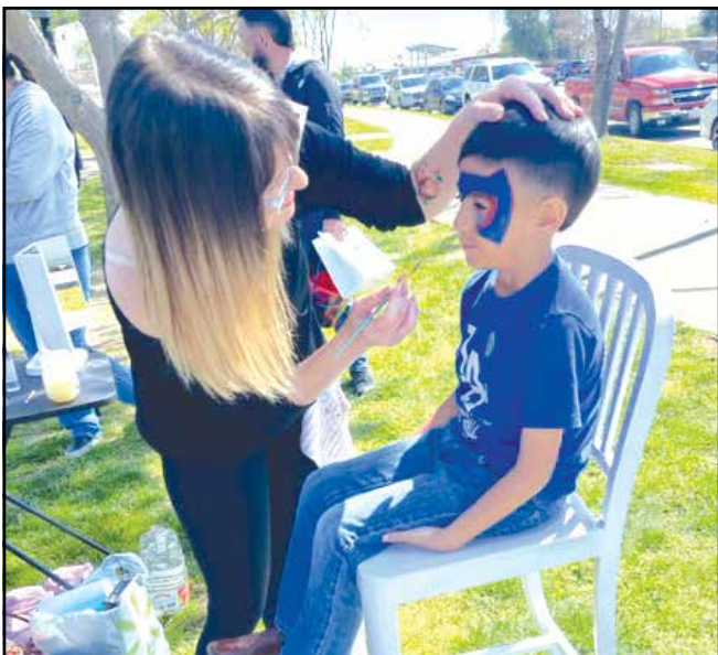
Face painting compliments of the Orange Heart Foundation was a big hit with the kids.