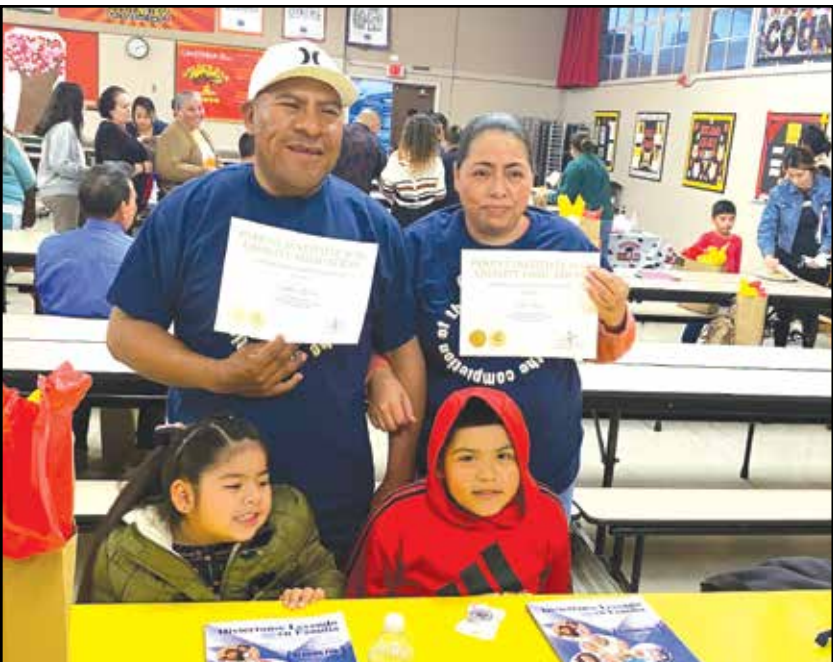
Students were there to cheer on their parents as they received their graduation certificates.