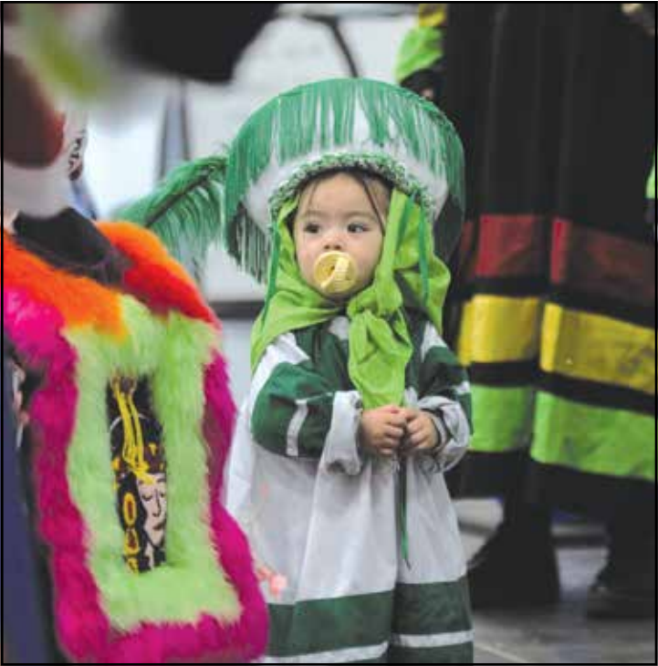
The Brinco del Chinelos were on hand to entertain the crowd.