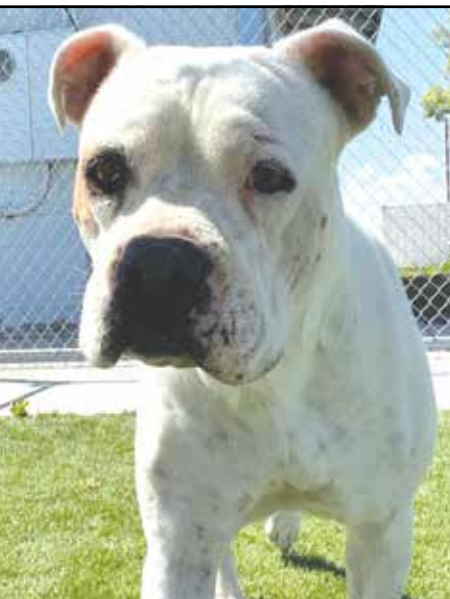
Jamie is a female boxer mix.

Jamie came in as a stray to the Wasco Animal Shelter. She is approximately a 3-4-year-old female boxer mix. Jamie is friendly, affectionate, gentle and great with staff and and other dogs. It is unknown if Jamie is house/crate trained at the time. Dogs are not tested with children. Her behavior towards children is unknown. Jamie will be available for adoption on Tuesday, April 11. Everyone is welcome to adopt from our facility, and we like to give everyone the same opportunity to adopt. Adopters can be from out of town and/or local. We do not place holds for adoptions. Adopters are responsible for transportation. Adoptions are on a first-come, first-serve basis, beginning at 8 a.m. on the date they are available. You are welcome to call us the day before their availability to en-