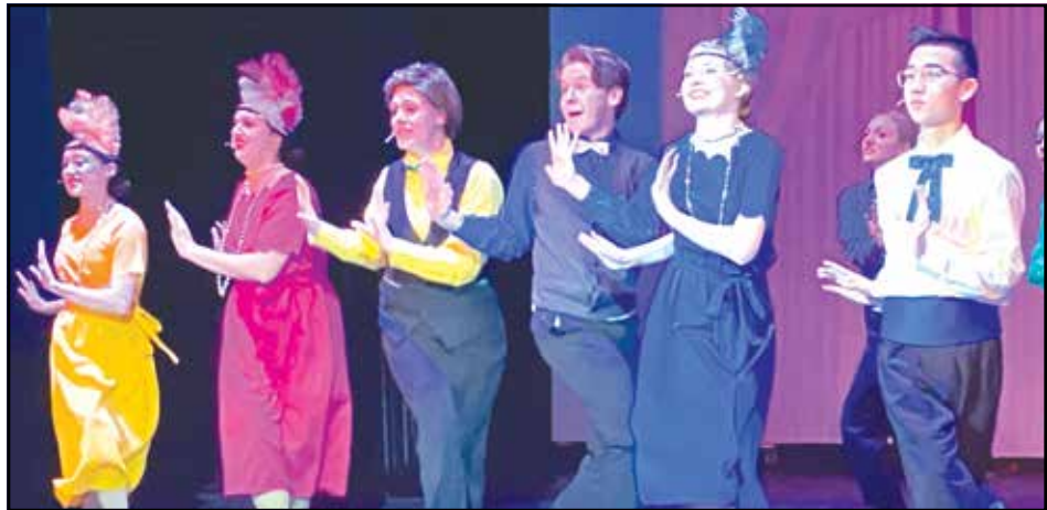
The numbers were challenging with singing and dancing.