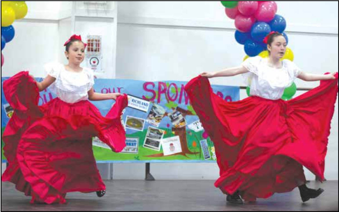
Shafter's Ballet Folklorico performed to the delight of the crowd.