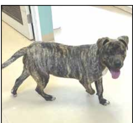
Hank is looking for a forever home.

Come and meet this loveable guy named Hank. Hank is a brindle pit bull mix who is guessed to be about 1 year old. This sweet boy has been neutered and is now available for adoption. Hank has a lot of energy and would do best with a strong handler when going out on a walk. Since his stay at the shelter they have learned Hank loves people and is quite a ham! He has so much character and personality, you will never get bored. The staff would recommend keeping a close eye on him with smaller animals. Hank has passed all portions of his SAFER evaluation and has done well