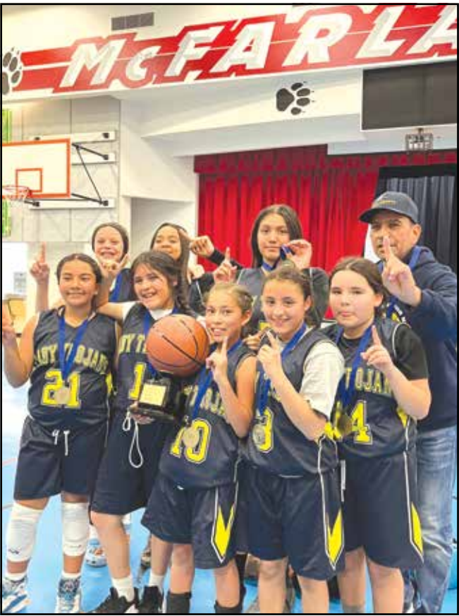
The 7 th Grade Trojans went undefeated, finishing the season with an 18-0 record.