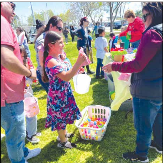
Every child walked away with treats.