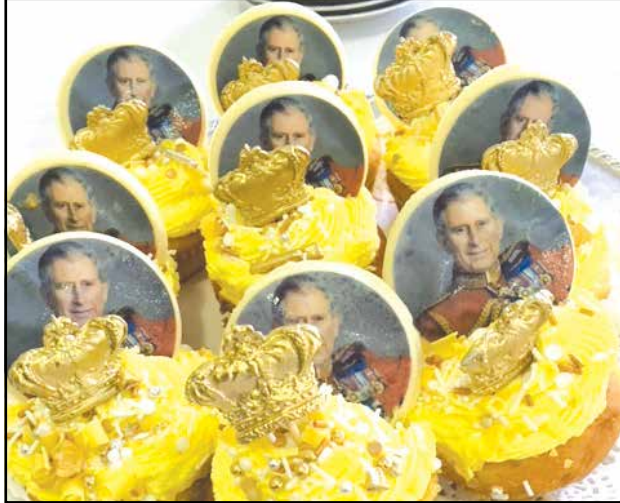
Guests were treated with lemon curd cupcakes featuring images of King Charles III.