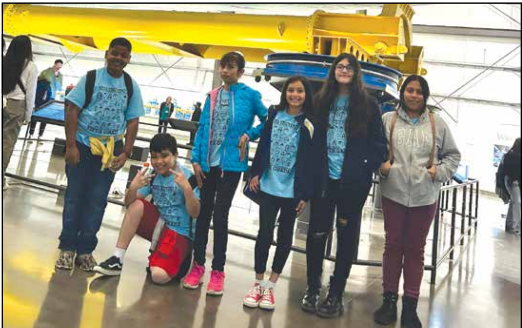
Scholars were able to visit many displays, including parts of the Space Shuttle Endeavor, on a field trip to the California Science Center in Los Angeles.