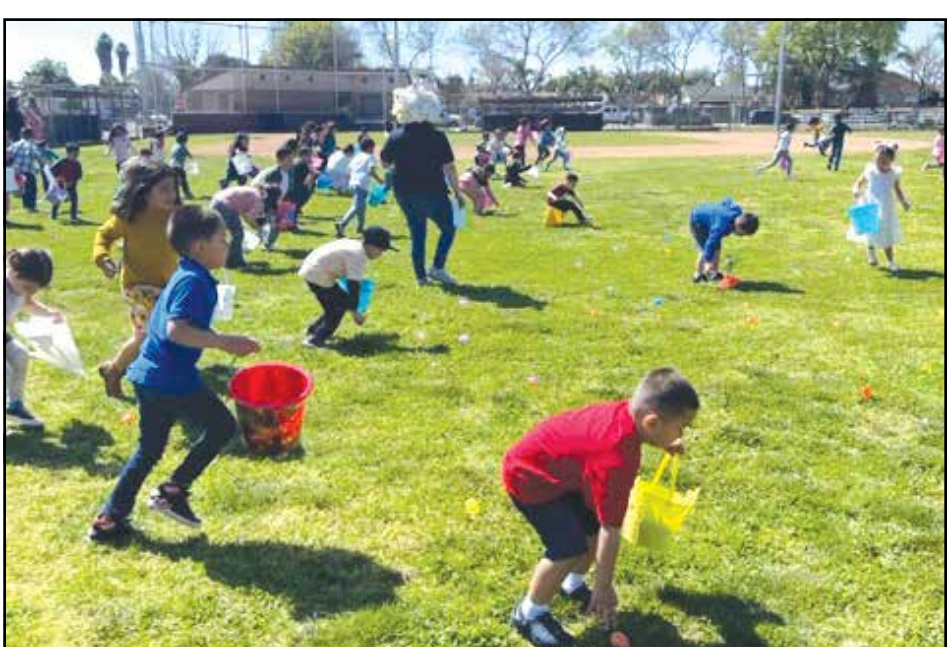
Young ones charged the field on the hunt for Easter eggs.