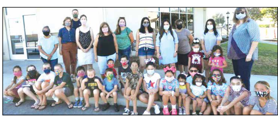
Everyone who enters the library must wear a mask.

You can now go inside to make copies, access the computers or use reference services among other things. vices as the county moves through its re-opening phases. Call 661-868-0701 or email info@kern-library.org for more info.