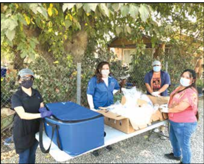
The Golden Oak operation includes delivering to students in the Smith Corner's/La Colonia area.

Though the students are not able to attend school in-person, they are still in need of a nutritious breakfast and lunch, which have been provided by the staff.