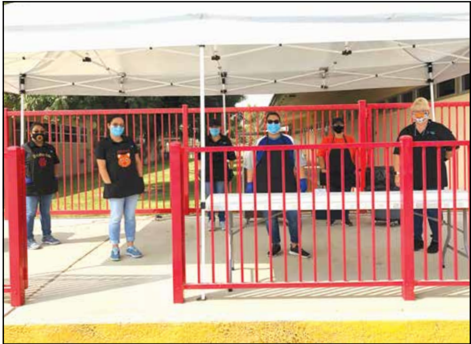
The Golden Oak late crew prepare grab and go lunches.

In addition to Ashmore, the staff at Golden