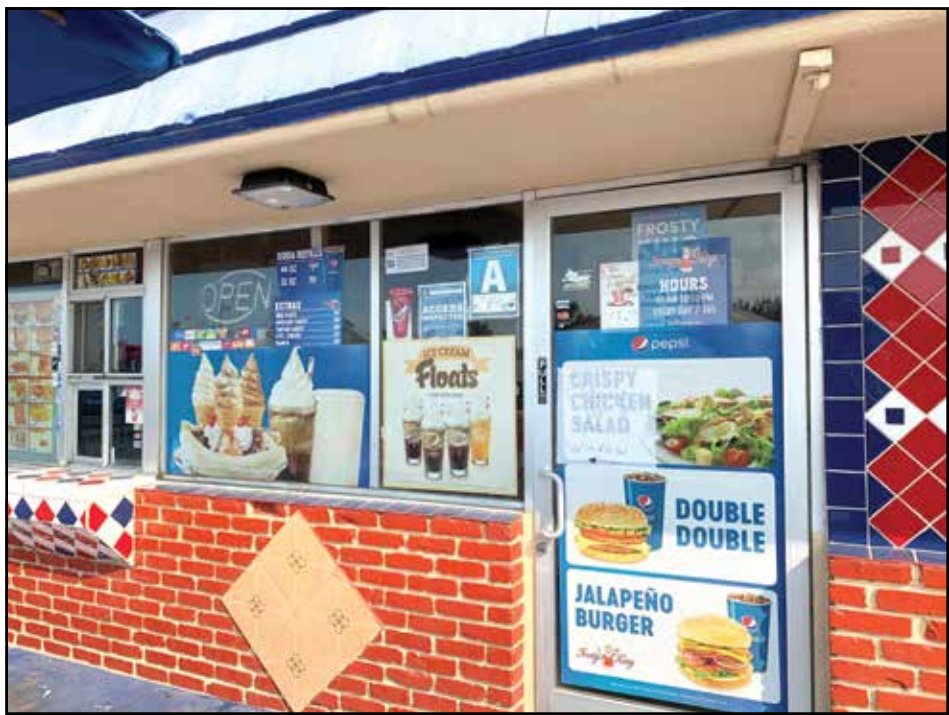
Just a few of the menu items.

area in the front of the building; but most customers use the drive-thru.