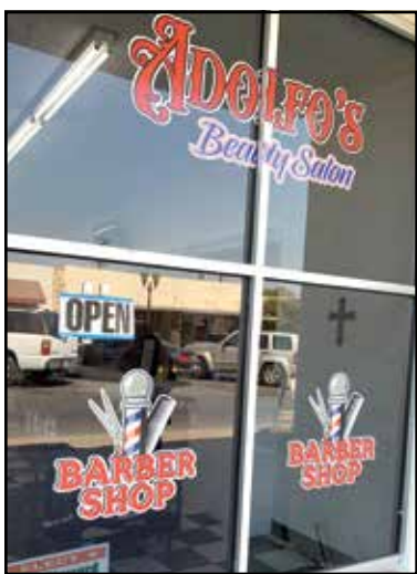
Adolfo's Barber and Beauty Salon is fully open.