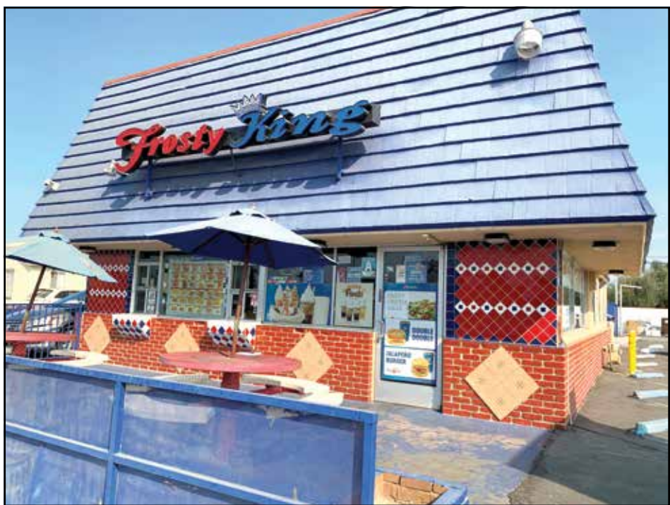
A street view on Highway 46 of the front of Frosty King.

The COVID-19 pandemic did not affect Frosty King because most of their customers are take out. There is a small seating