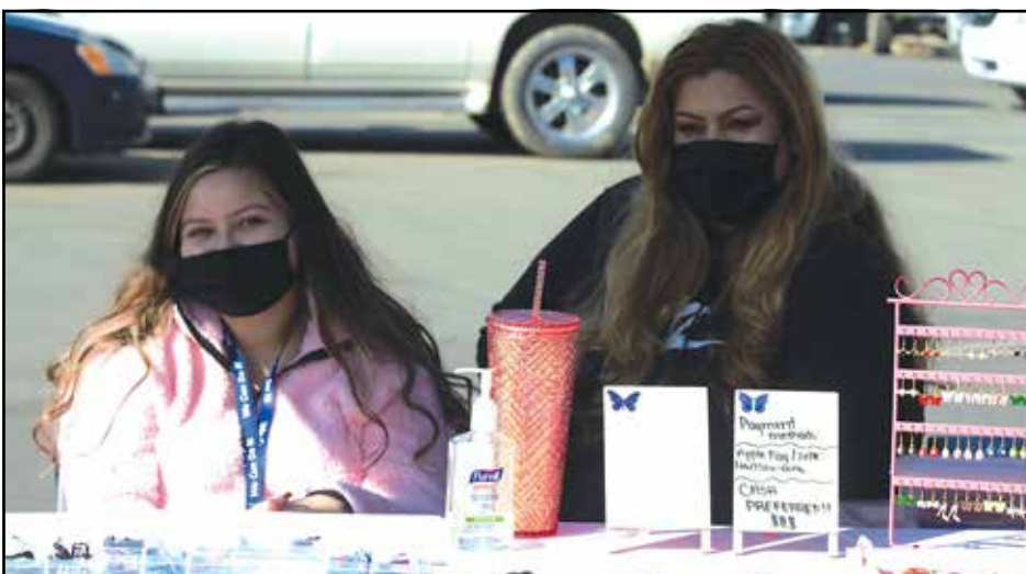
Crystal M Creations were selling their jewelry.