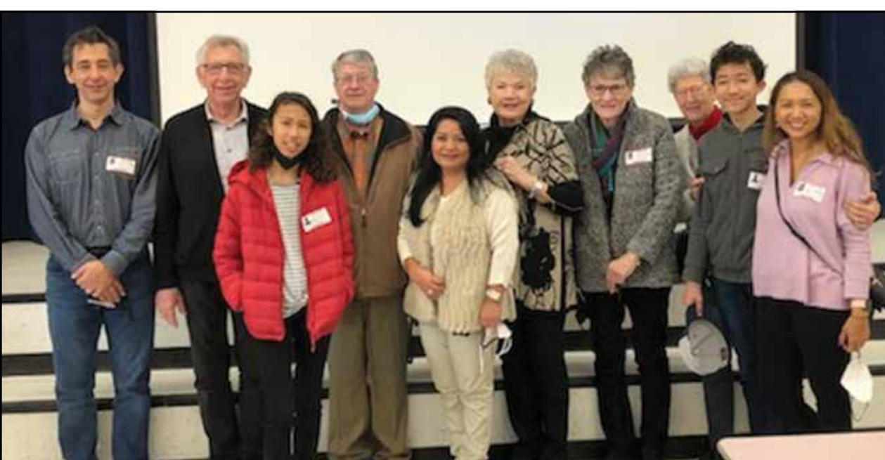
Prueitt staff with the Coffinier family along with Prueitt's daughters.