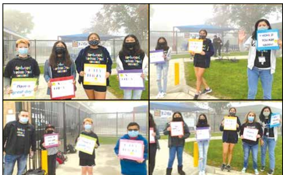
The Kindness Squad was out in force welcoming students and staff back to school.

The goal is to spread their vision of teaching the importance of kindness on campus and helping students feel safe and welcome when arriving on campus.