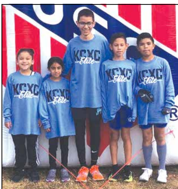
Lost Hills Cross Country AAU Champion runners.