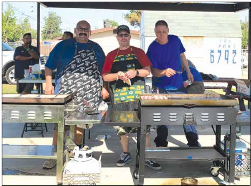
VFW pancake breakfast.