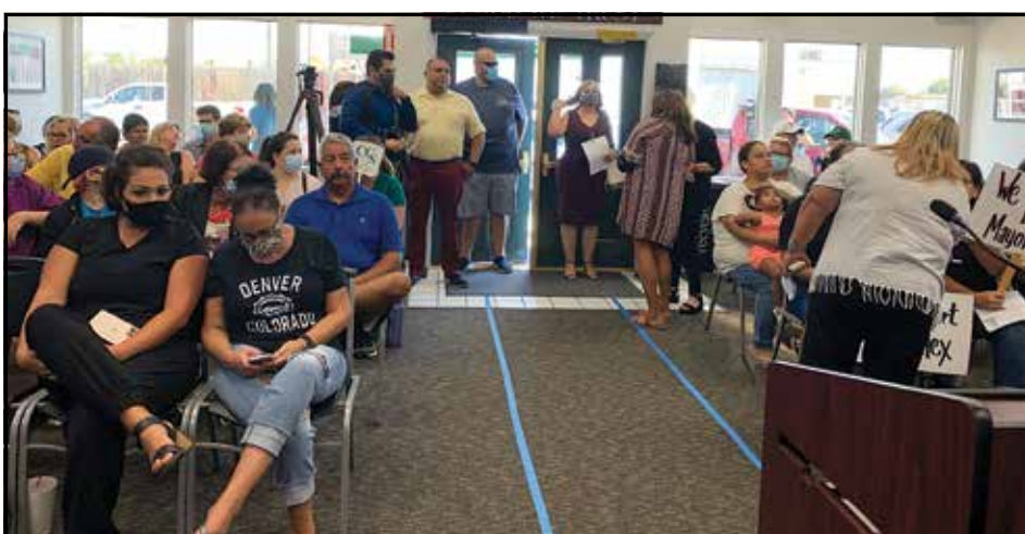
Wasco City Council meeting attendees.