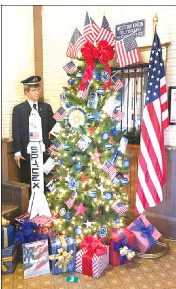
The Shafter Rotary Club received second place with this red, white and blue American-themed tree.