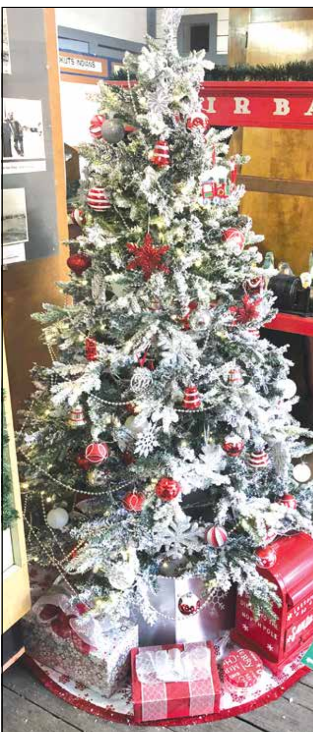
Red, White and Silver was the title of this tree created by the Shafter Women's Club.