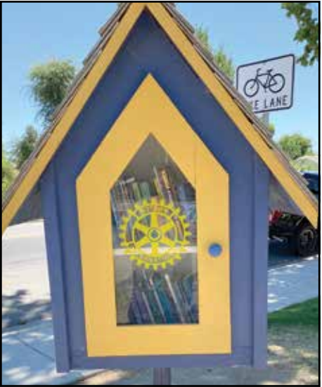
This Little Library at Mannel Park is sponsored by the Shafter Rotary Club.

There has been a trend in the last 10 or 15 years of Little Libraries dotting the landscape, making books available for those who may not be able to get to the library, or don’t have the means to buy books of their own.