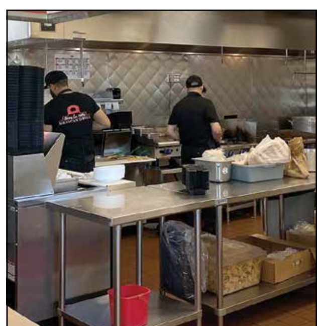
Members of the Tacos La Villa team working hard to serve the community.

Tacos la Villa, 135 Central Valley Highway, is open Sunday through Thursday from 5 a.m. to 1 a.m., Fridays and Saturdays until 3 a.m.