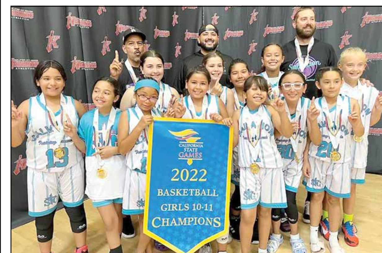
The STG squad went undefeated at the State Games to capture the championship.