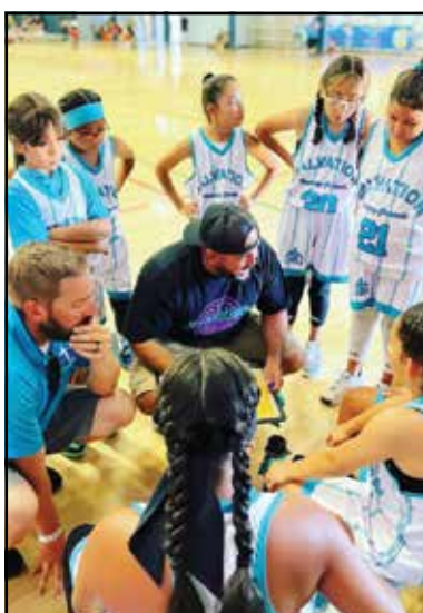
STG gets instruction during a time-out in their championship game.