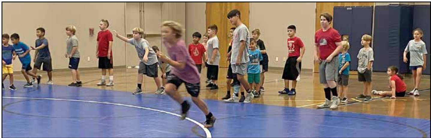
Wrestlers sprint as part of their workout.

According to Pastor Coyle, this verse also serves as a template for the wrestlers to make sure they have a “solid” stance, one in which they cannot be shaken off of their feet.