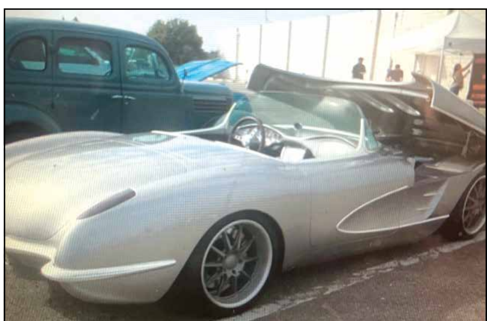
One of many classic cars at last year's event.

They still are looking for sponsors to ensure this year's event is another big success.