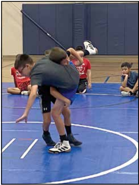
The campers learned basic takedown techniques.