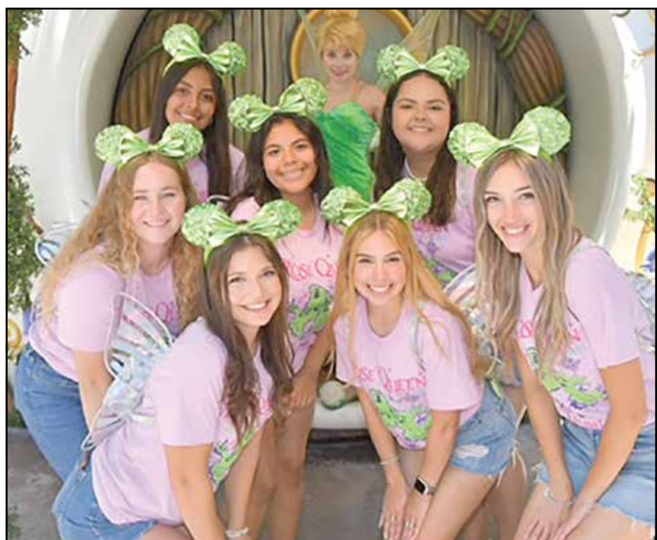
The girls dressed up in their matching outfits.

Day three was spent at Disney's California Adventure, arriving right when the park opened. They loved all of the rides and activities. After that, they did a little shopping in downtown Disneyland and then a sleepy trip back to their hometown of Wasco.