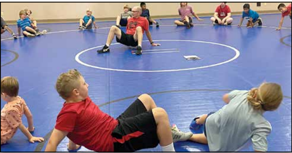
The kids learned several exercises to improve their flexibility and maneuverability.

The public is invited to the exhibition at the church’s Fellowship Center, 400 Kern St., beginning at 7 p.m.