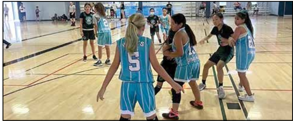
The team played a great game on the offensive and defensive side of the ball.