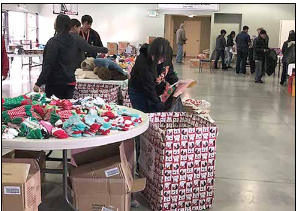
Volunteers sort socks and toys to give out to kids during Christmas time.