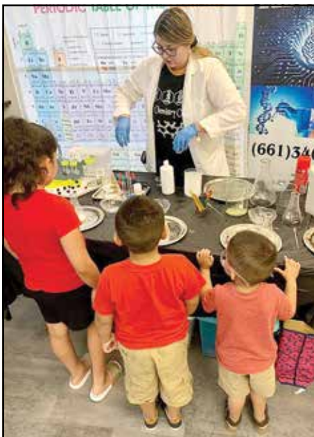
Science experiments are a big attraction at the Learning Center.

The classes run for one week, with a total of seven sessions running through July 29. The Learning Center has classes for all age groups, ranging from Pre-K students through those in the eighth grade. Pre-K students have the option of taking English and Spanish classes. First and second graders can learn Spanish, as well as classes in crafts, math games, astronomy, science experiments, elementary engineering, art, cooking, and keyboarding/coding. For those students in the third and fourth grades, they have the same options as the younger students, as well as offerings in robotics and geology. Fifth and sixth graders have even more options, with physics, future sous chefs, and introduction to Google slides and cryptocurrency being offered. Seventh and eighth grade students have five classes to choose from. They can take classes in cooking, building bridges, science experiments, physics and art. The Pre-K to fourth grade classes are being offered in the morning, with those in grades fifth through eighth are in the afternoon. In addition to these classes, the Learning Center is offering a Lego Wall and Alligator Sensory Wall, which allows the kids to interact with the wall, building as well as being able to feel the different textures on