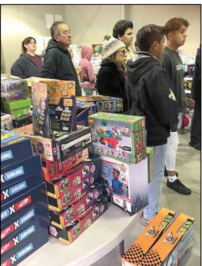
Volunteers get ready to distribute hundreds of toys for the holiday season.