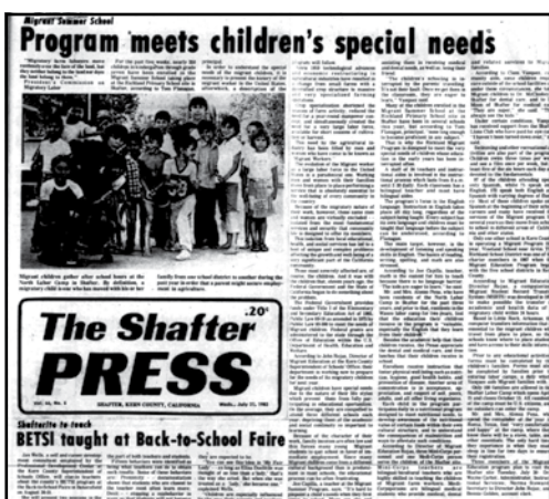
The front page, July 21, 1982