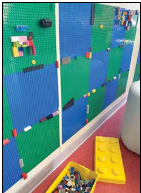
A Lego Wall lets the students interact as they build and feel the wall.