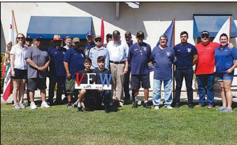
Aera Energy, VFW members and SAL kids all assisted at the VFW Barbecue.