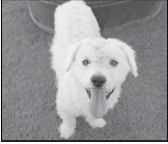
Isaiah is a poodle mix male.