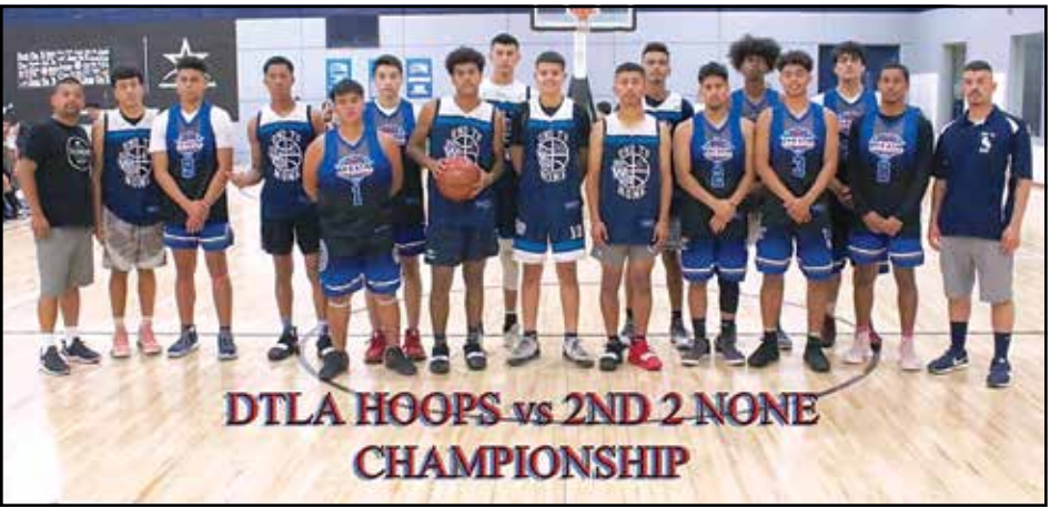
2nd to None won the high school division.