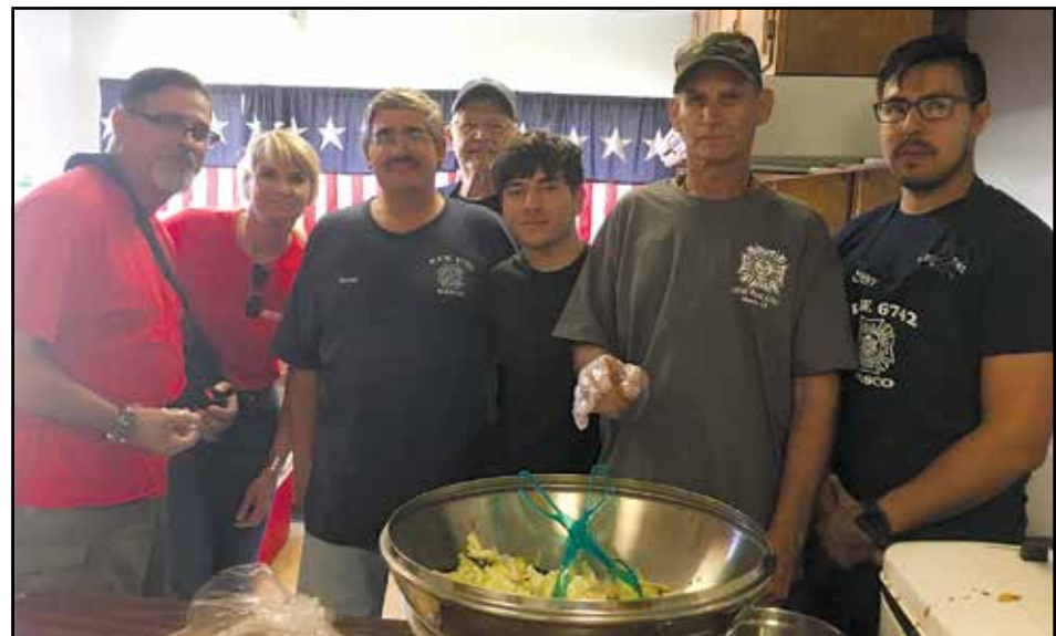
The cooks in the kitchen.