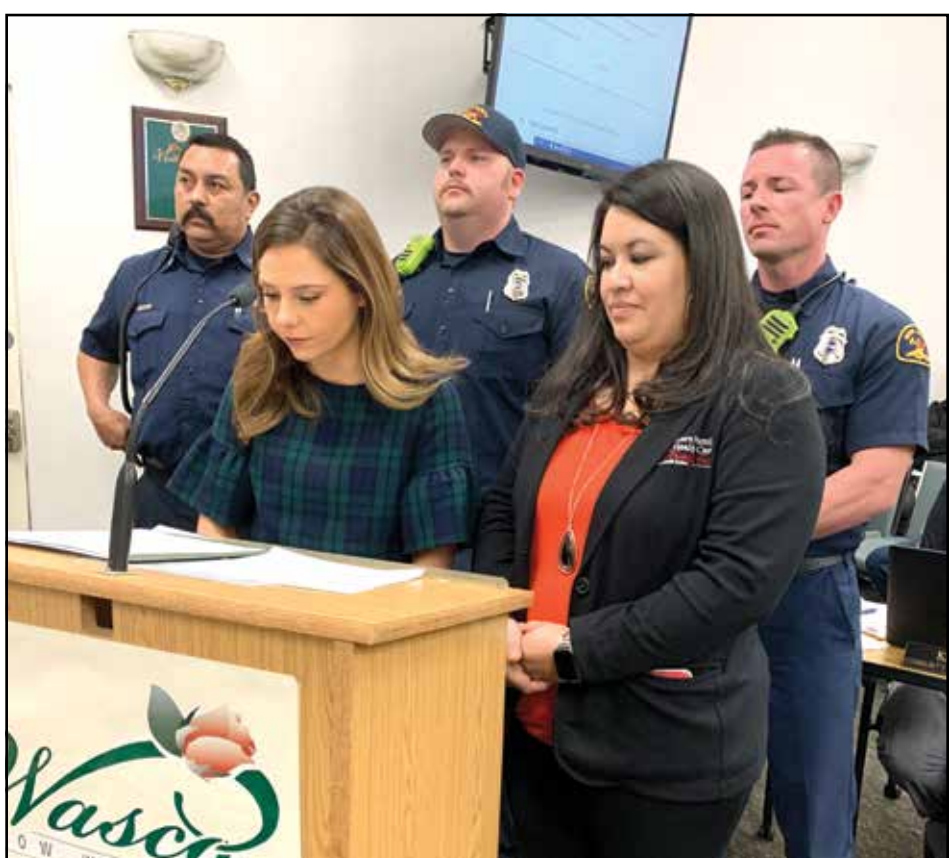
Kern County firefighters with Safely Surrender members.