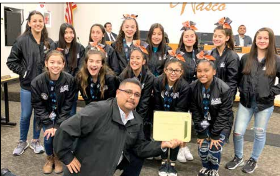
Mayor Tilo Cortez hams it up with the Bengals varsity cheerleaders.