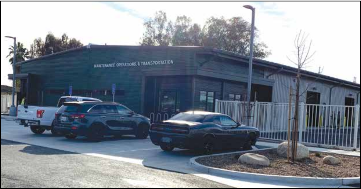
From the outside the MOT building.