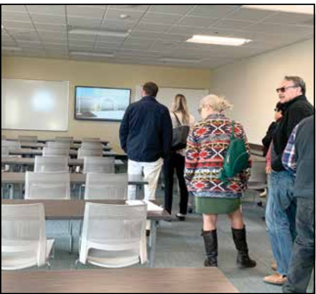
A view of the training room.

Once the introductions were completed, Richers invited everyone to take a tour of the new facility. He