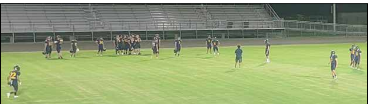
The Generals will be playing on their own field this year.

"I believe that this year's team will be playing its best football when it counts, in