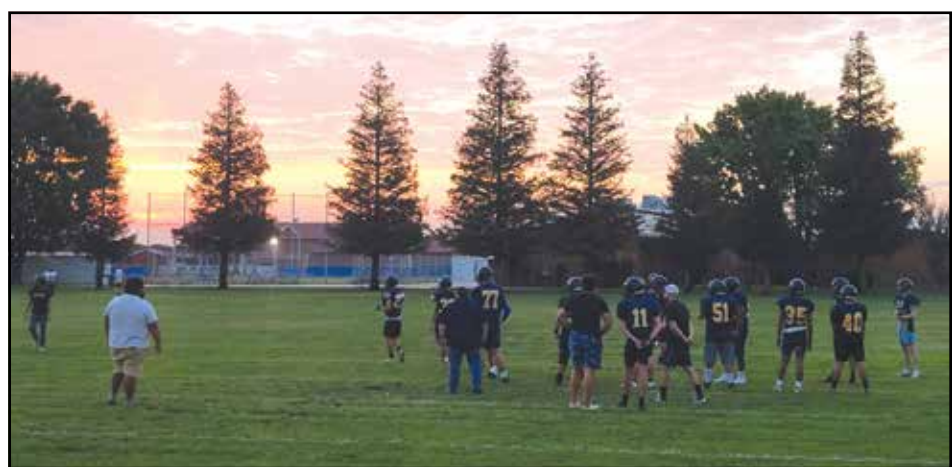
The Generals will be playing on their own field this year.