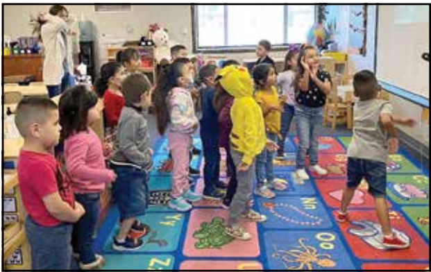
Richland Schools' transitional programs are for children ages 4-5.