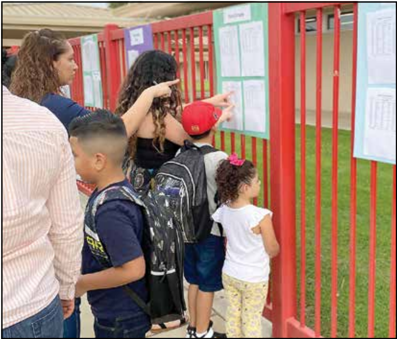
A line formed to see what homeroom each student would be in.