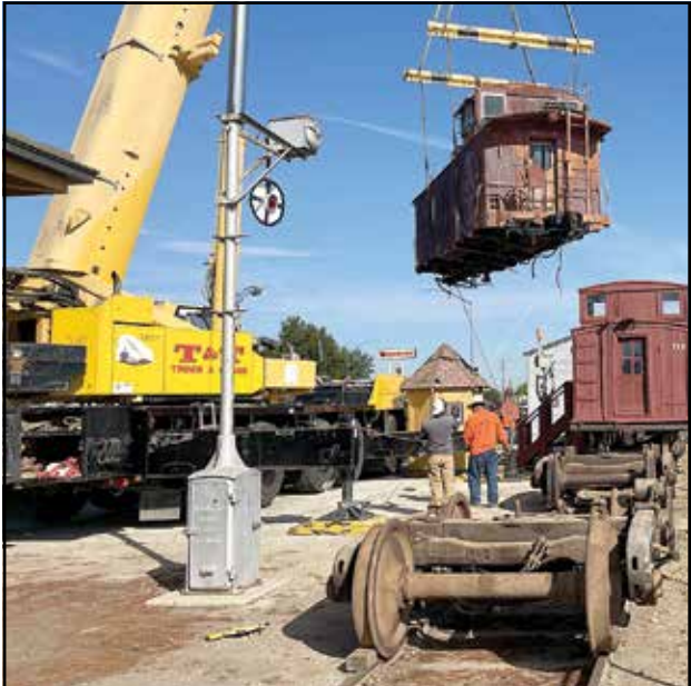
The caboose is on display at its new home at the Shafter Depot Museum.