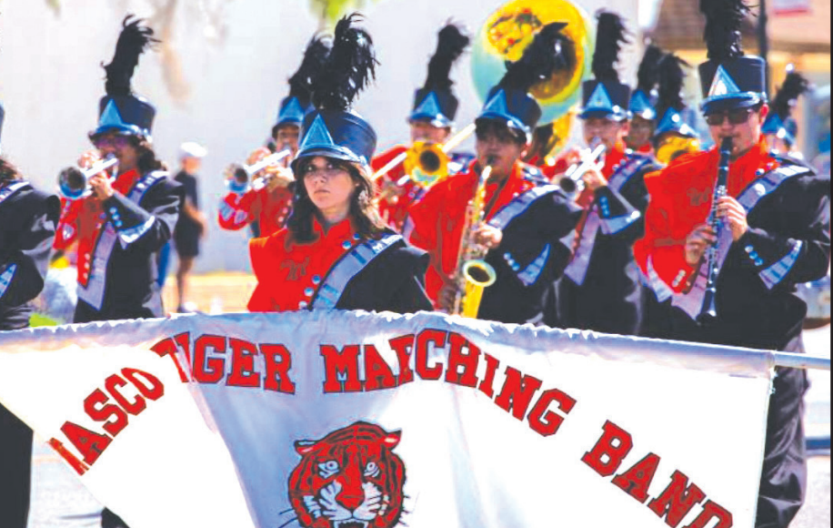
Student volunteers at the Traveling Tigers Forky's Friendly Pancake Breakfast fundraiser. The Wasco High School Tiger Marching Band played music and entertained the spectators.