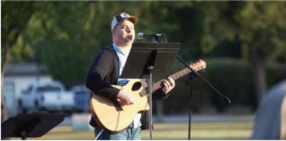
Praise and worship began the service.