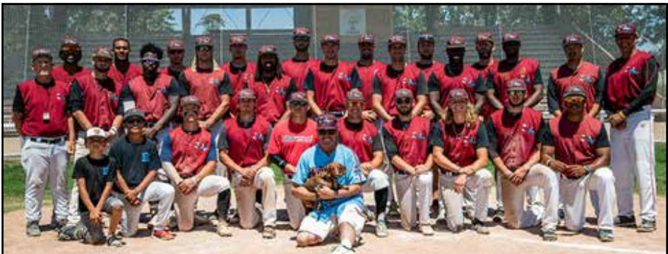
The Wasco Reserve 2019 team

Players stay for the summer and come from throughout the United States. A lot are recent college gradu-