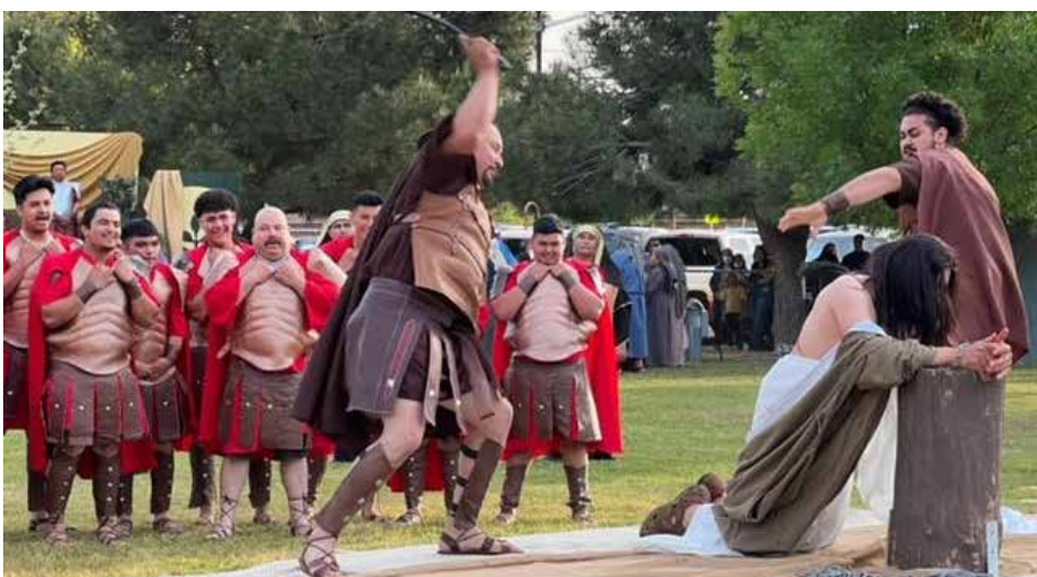
A scene from the reenactment and the cast