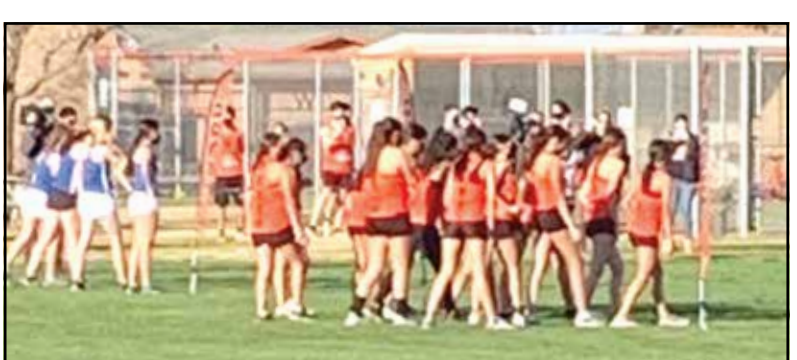
The starting line for WHS vs BCHS.