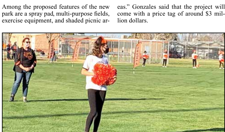
Cheerleader and an observer on the field during the meet.