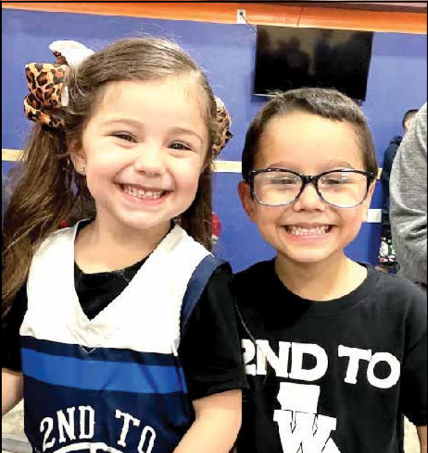
Two children support the tournament.