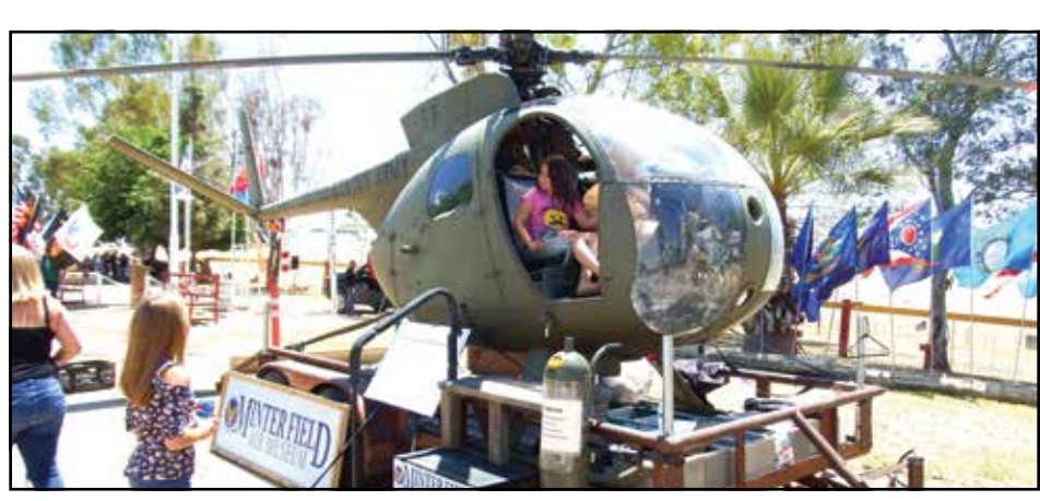
The LOACH helicopter remains a draw for residents.