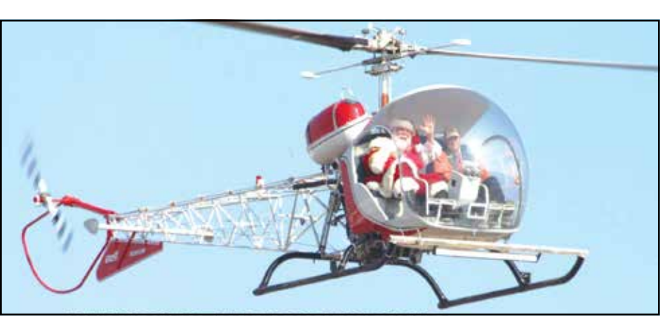
The museum played host to Santa Claus at Christmas time.

The event has a James Dean display, along with over 100 aircraft from different eras, including World War I and World War II warbirds. The museum is hopeful the event will return this year.