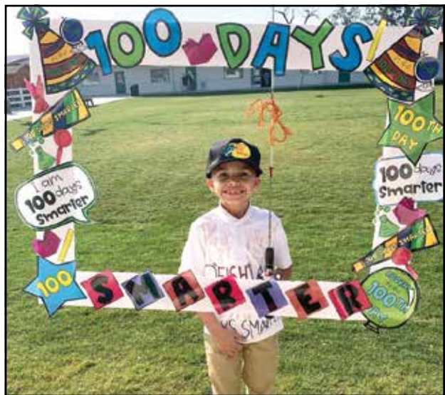
Grimmway recently celebrated their 100th day in session.

was placed in the red tier. They also had signed waivers for in-person learning for all of their students. Yeazel said that since they were already open when Kern went purple again, they are allowed to stay open.