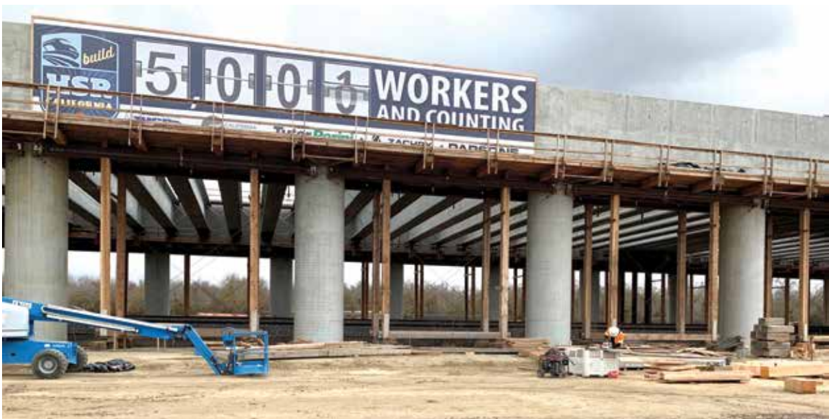
The 5,000 workers is almost ready to turn to 5,001 workers.