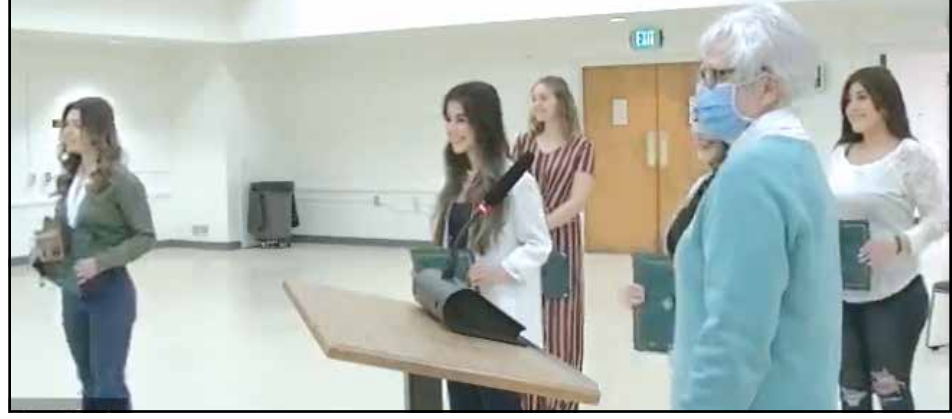
The young women of the DYW of Shafter were honored at the meeting.