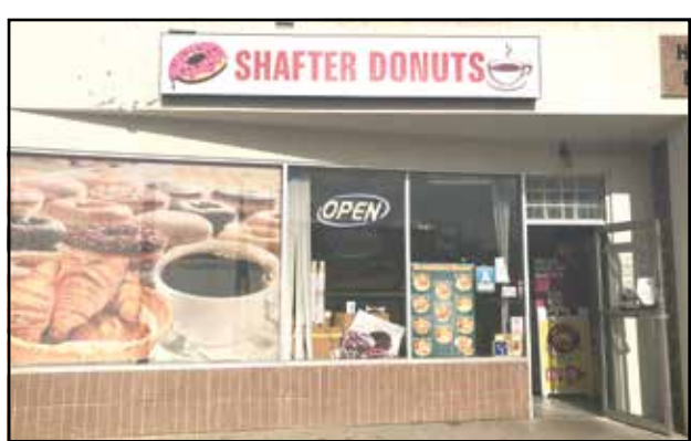
Shafter Donuts has been a go-to in Shafter for over two decades.

They also serve a variety of sandwiches for lunch including tuna, ham and cheese,