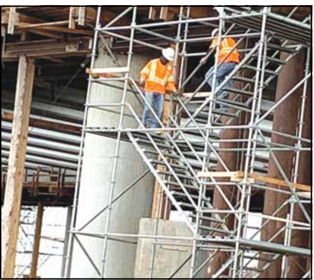
Workers descend the stairs and scaffolding.