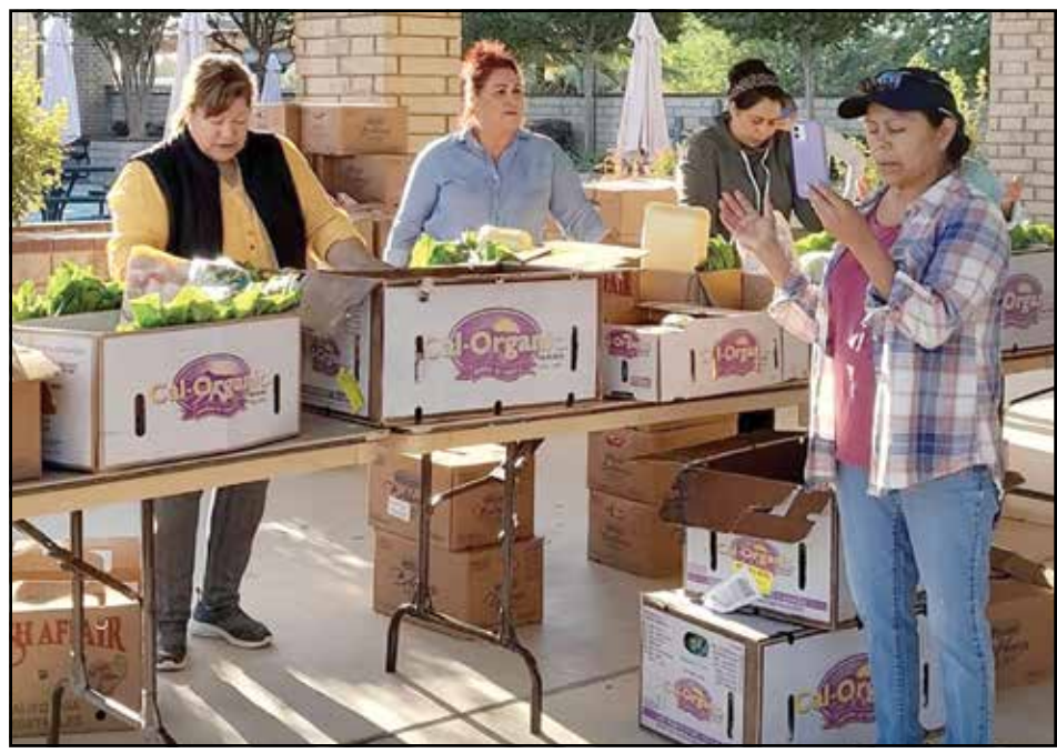
Volunteers lending their time to serve the community.