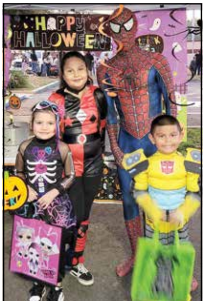
Children dressed in their creative costumes posing with spiderman.

decorations for the kids and family members.