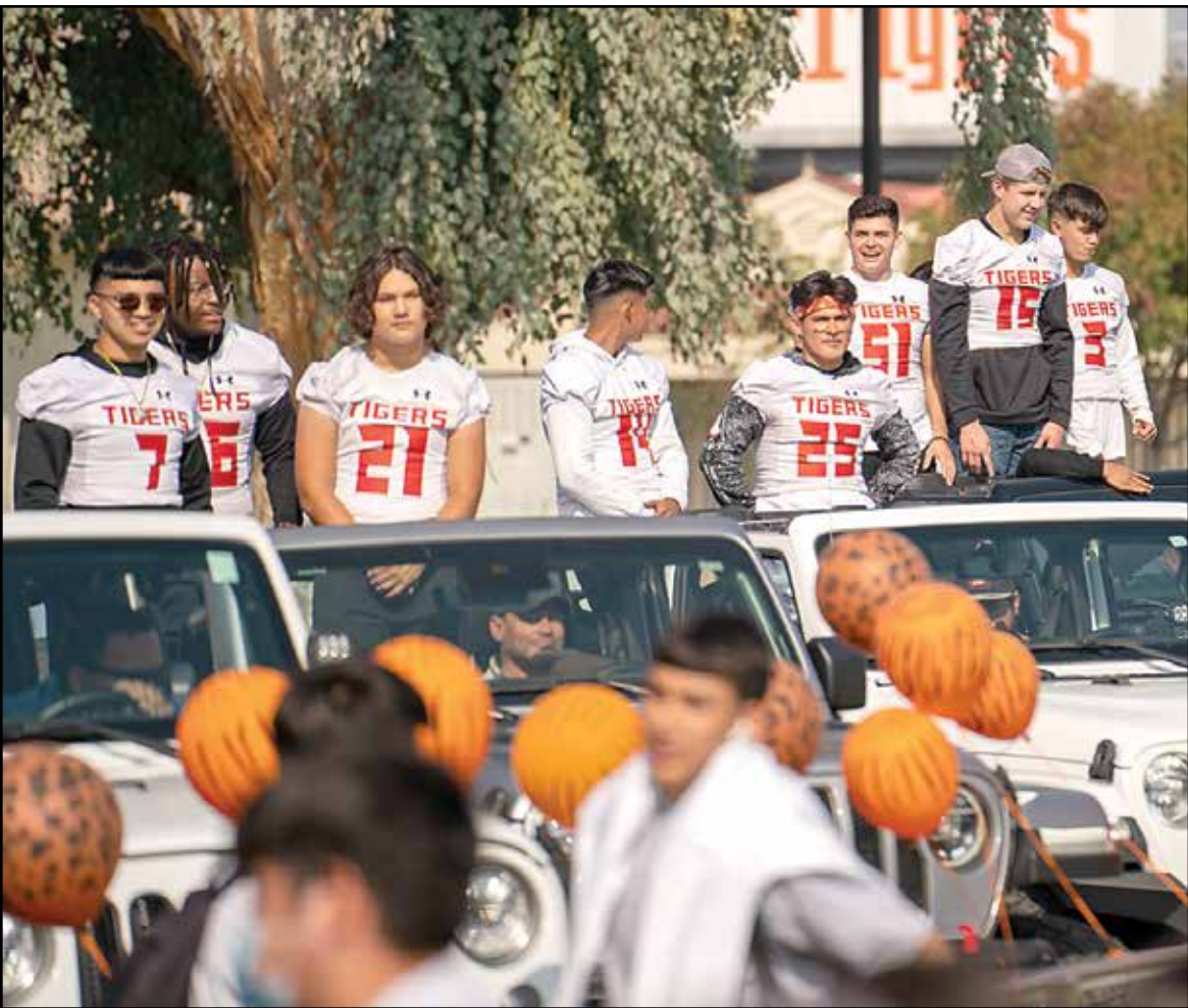
WHS football players arrive in style for the 2021 game.