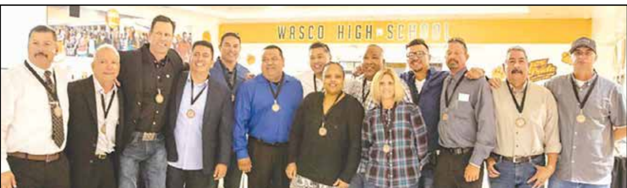
The 2018 Hall of Fame inductee class.