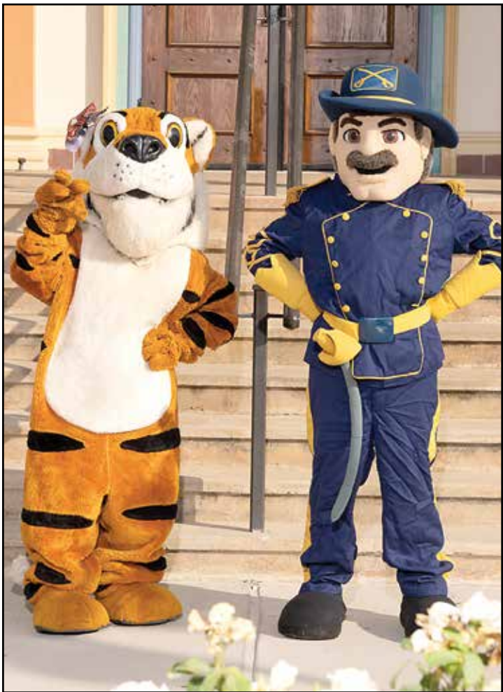
WHS students cheer for the football players at last year's rally