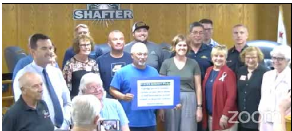
Several of the attendees took the pledge to combat the issue of domestic violence.

The council also had a presentation done by the Shafter Woman's Club recognizing October as Domestic Violence Awareness