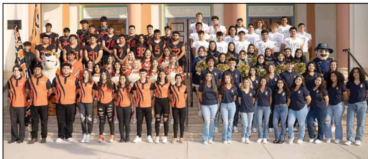
Wasco High School and Shafter High School football players, cheerleaders and ASB officers.