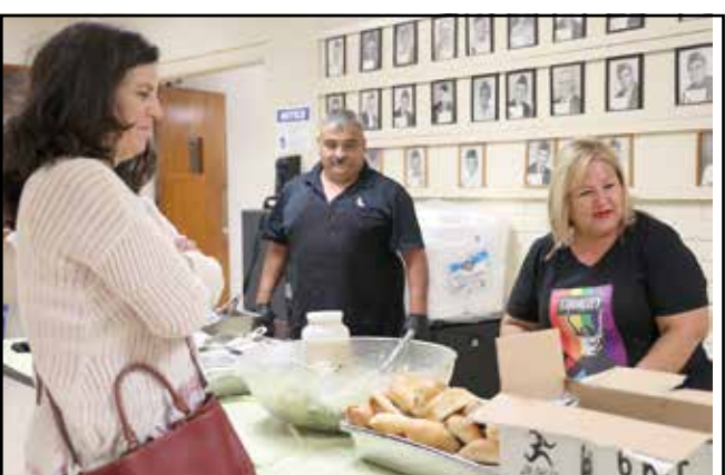
The food for the event was provided by Martin's Meats.