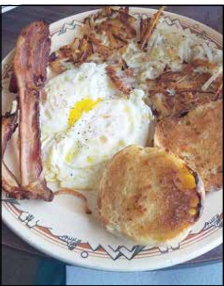
The portions fill the plate at the Red Wagon.