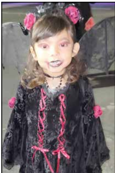
A young trick-or-treater.

Following this event, the WRPD team is already working on the first annual Wasco Art Festival on Nov. 5.