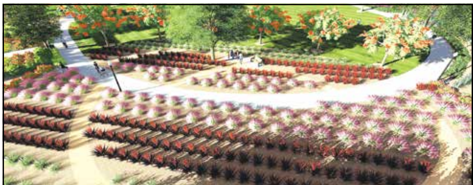
The rows of shrubs are crop-like in design.