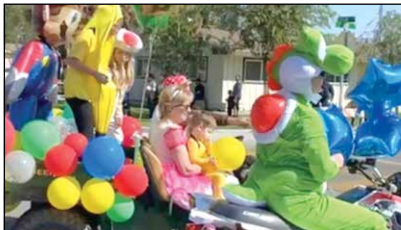
Participants in the 2021 Rose Parade in their decorated three-wheelers.