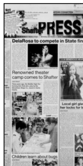
Front page, July 18, 2012.