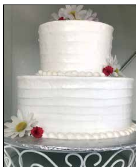
A two-tier cake for all occasions.

"They used to come in their strollers, and now they are adults bringing their chil-