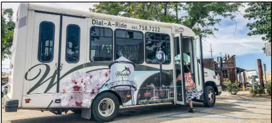
Dial-A-Ride bus provides comfortable and safe transportation for City of Wasco residents.