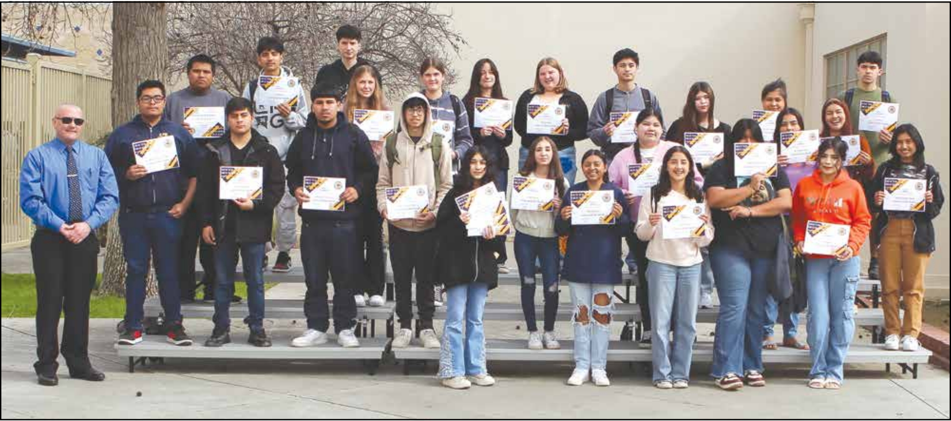
Generals of the Month were named for their performance in and out of the classroom.