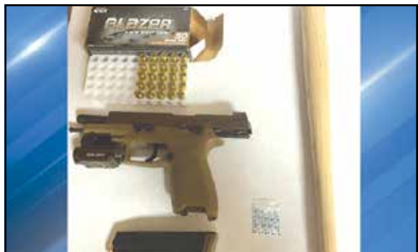
A gun, ammo and a "billy club" were some of the items retrieved from the vehicle.