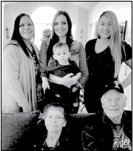
Five generations in one picture.