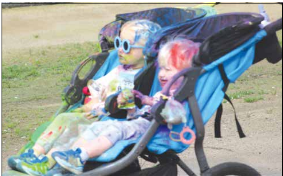
These kids cruised through the Colours Fun Run in style.

jazz quartet entertained the crowd with a variety of standards. The weekend was closed out with a worship service at the Tin Cup. People from all denominations gathered to listen to music and worship the Lord.