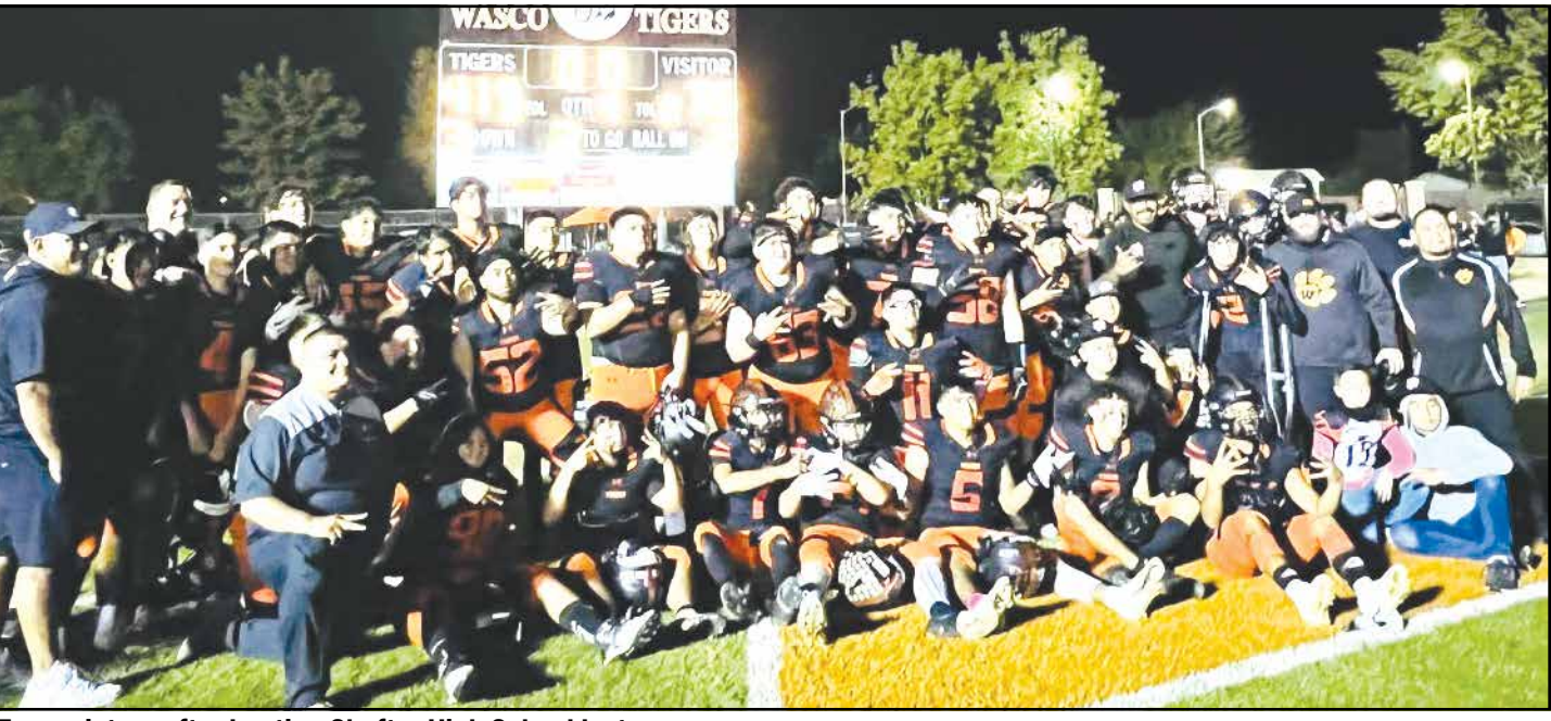
Team picture after beating Shafter High School last year.

They will also play against teams from Delano, Taft and McFarland.