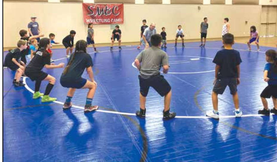
A proper stance is the beginning of the learning.