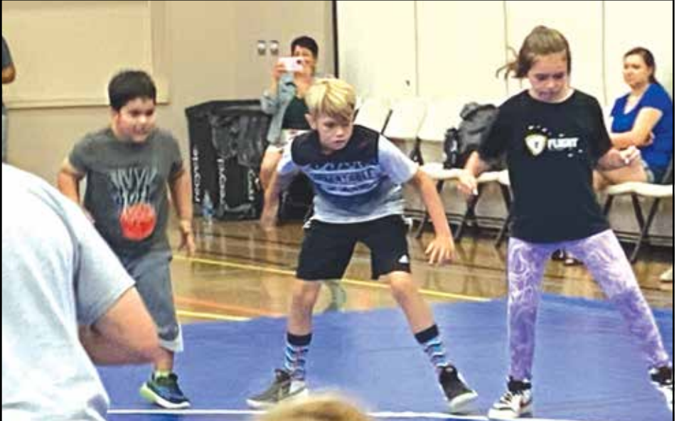
The kids learned how to move laterally while in their stance.