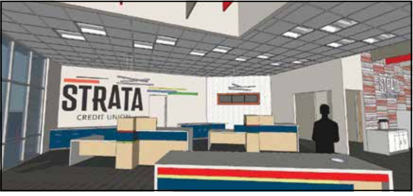
A rendering of the interior and exterior of Strata Credit Union.