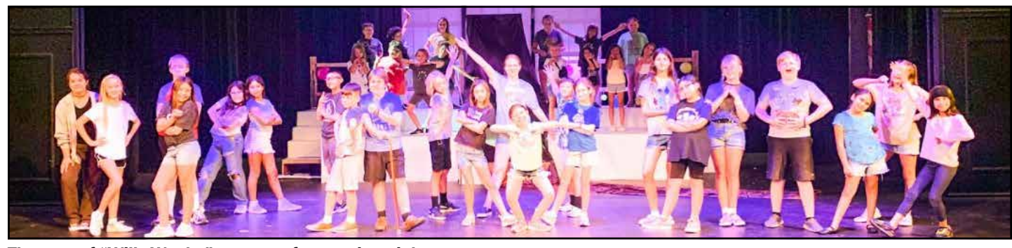
The cast of "Willy Wonka" prepares for opening night.

In the play, the five tickets are hidden