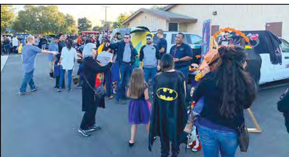
Independence High had a photo booth where kids with masks had their picture taken.