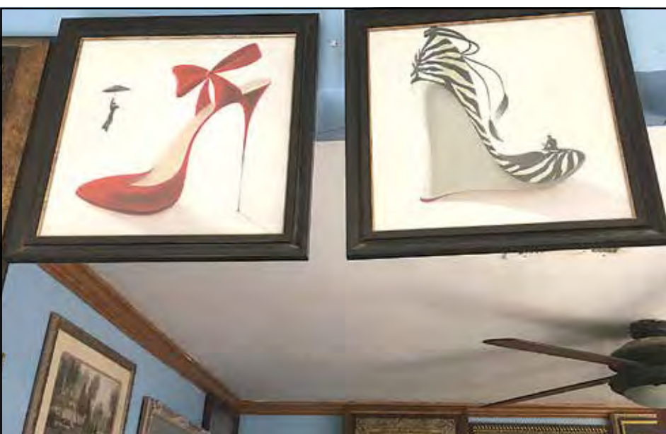
A couple of the pictures hanging on the walls.