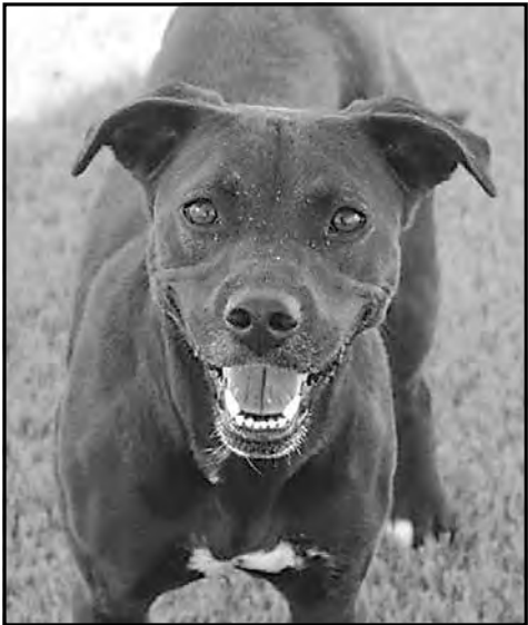
Twinkle is about 2 years old.