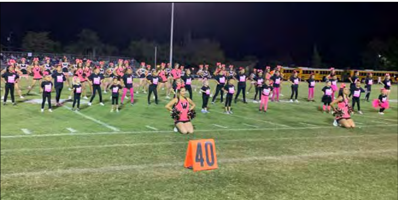
ABOVE: Darling Divas performed alongside the cheerleaders. RIGHT: Varsity cheer performs a routine for the crowd.