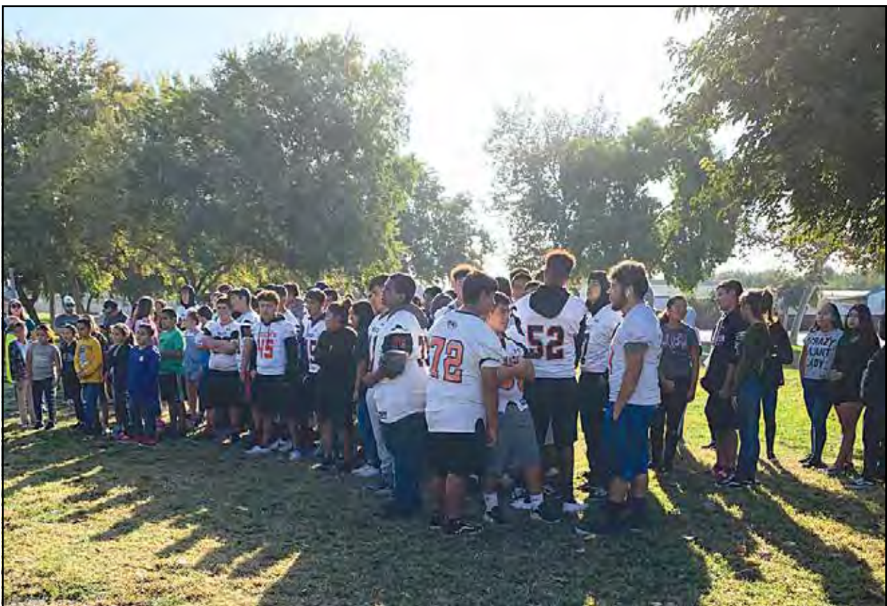
WHS varsity football players came out to help with the cleanup.