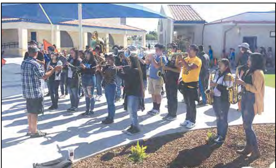
The Forrest band played at the beginning of Red Ribbon Week.