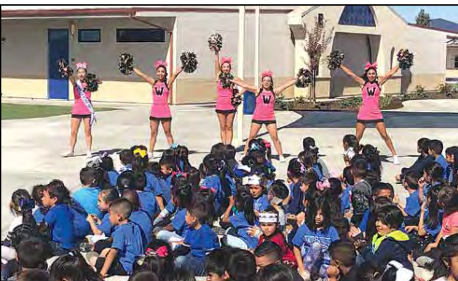
The WHS cheerleaders performed for the Forrest school students in their pink uniforms in recognition of Breast Cancer Awareness Month.