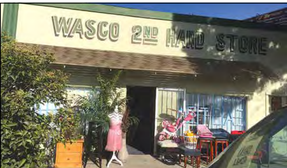
The front of 2nd Hand Store on F Street.