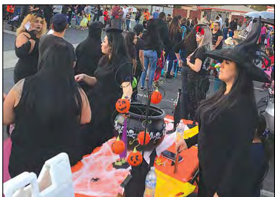
Adults dressed up just like the kids.