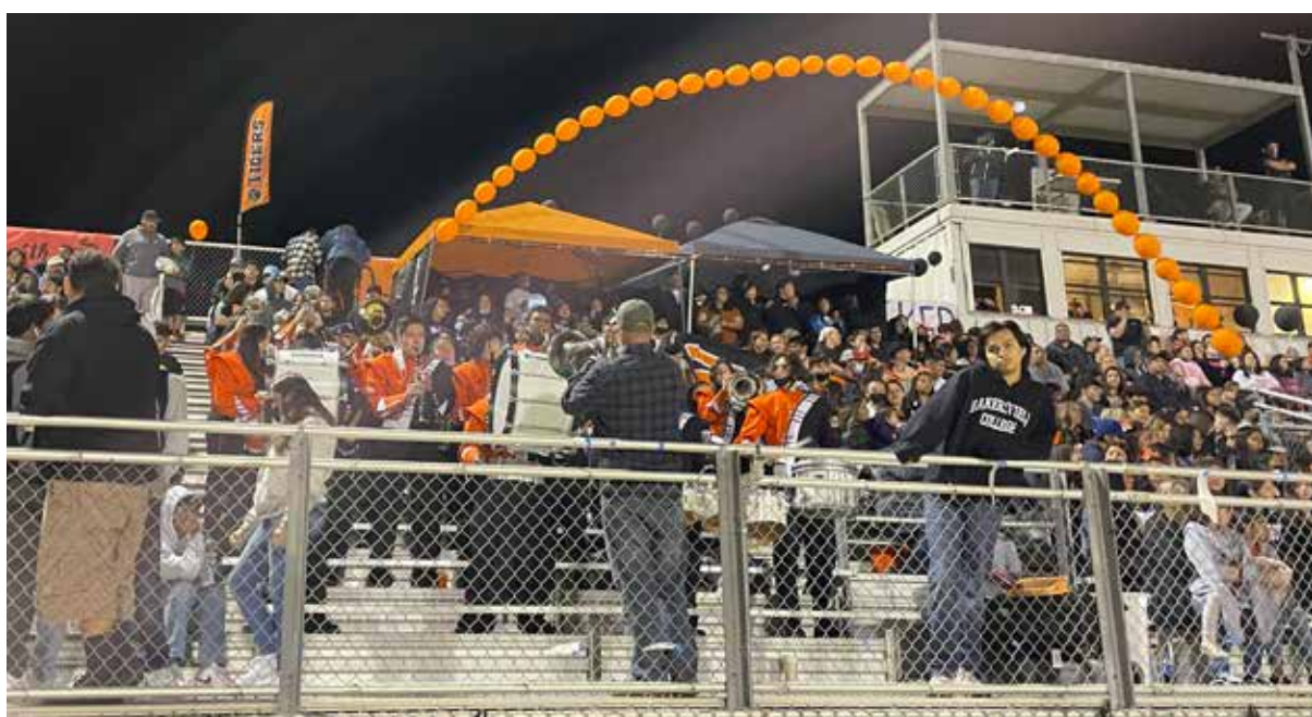
The bleachers were full with spectators for the game.