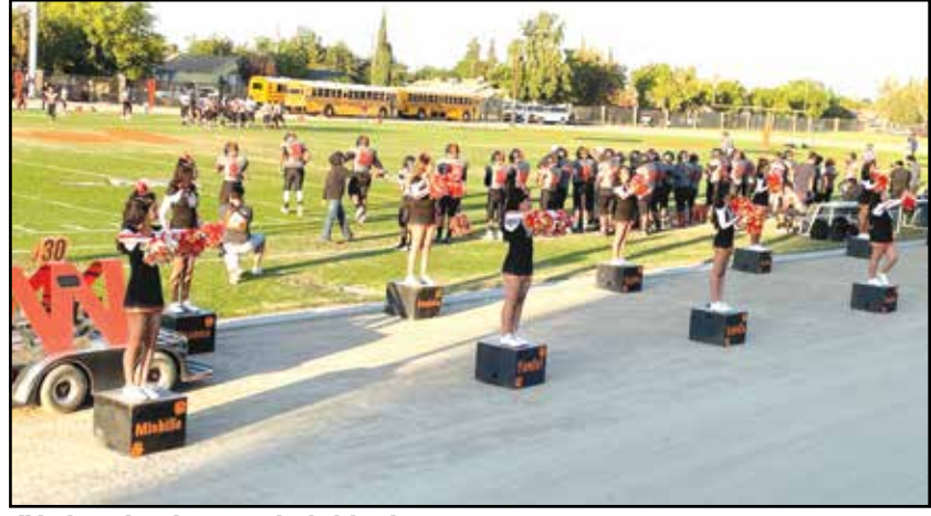
JV cheerleaders on their blocks.

The float winners were 4th place sophomores, 3rd place freshmen, 2nd place seniors and 1st place juniors.