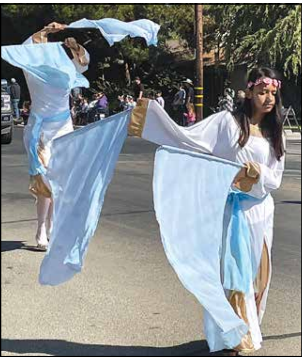
New Generation Church dancers.

Last Saturday morning, parade entrants began to line up, ready to march in the Rose Festival Parade. It was a parade that almost