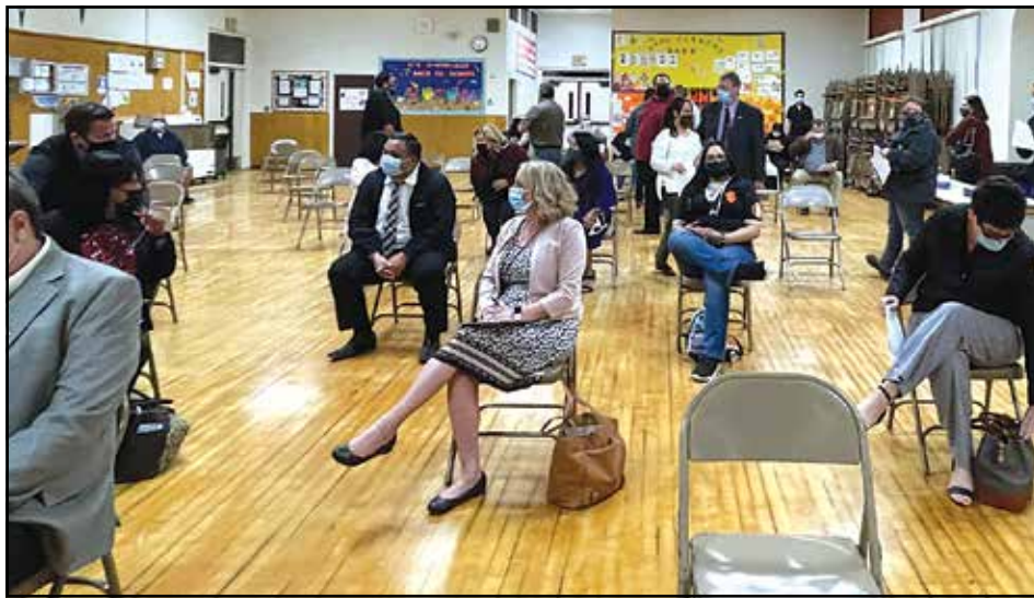
Concerned residents attended the board meeting.

Three people addressed the board, declaring their dislike for the policy. Their concerns were also about the impact the policy would have on the mandates expected to come in January or June that will eliminate the testing alternative.