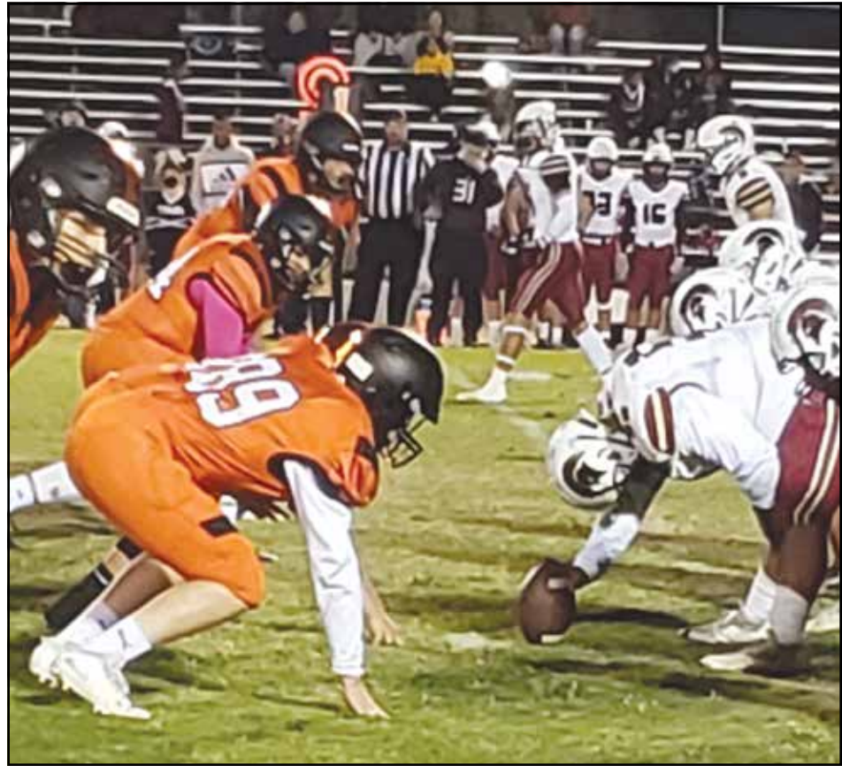
The Wasco defense lines up against Cesar Chavez.