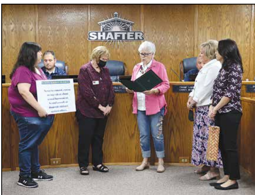
The Shafter Woman's Club presented the council with a pledge against domestic violence.