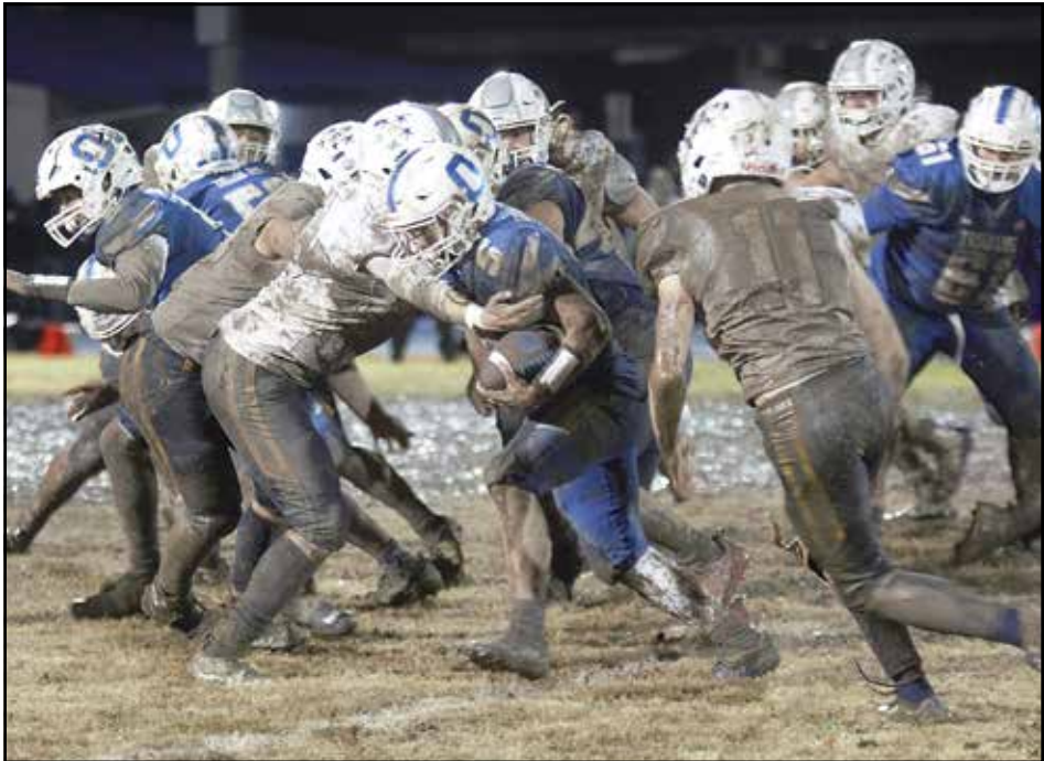
The Generals’ defense makes another stop, giving the ball to the offense.