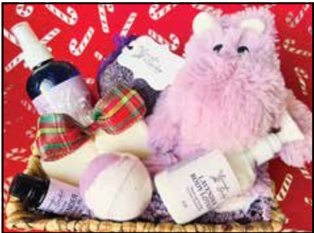
There is a variety of lavender products for sale in the new gift shop.

are located at 14014 CA-46 in Lost Hills on Highway 46 between Bakersfield and the Central Coast. You can also visit them online at thelavendergarden.com .