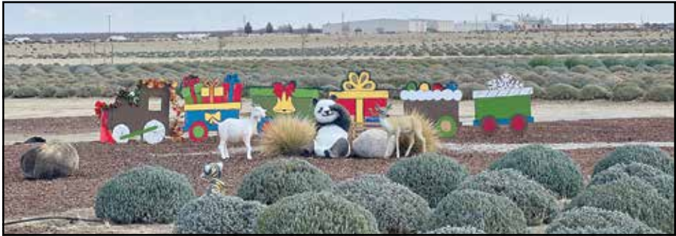
This holiday season, the Lavender Garden is featuring a train, lights and decorations to their animal sculpture garden.