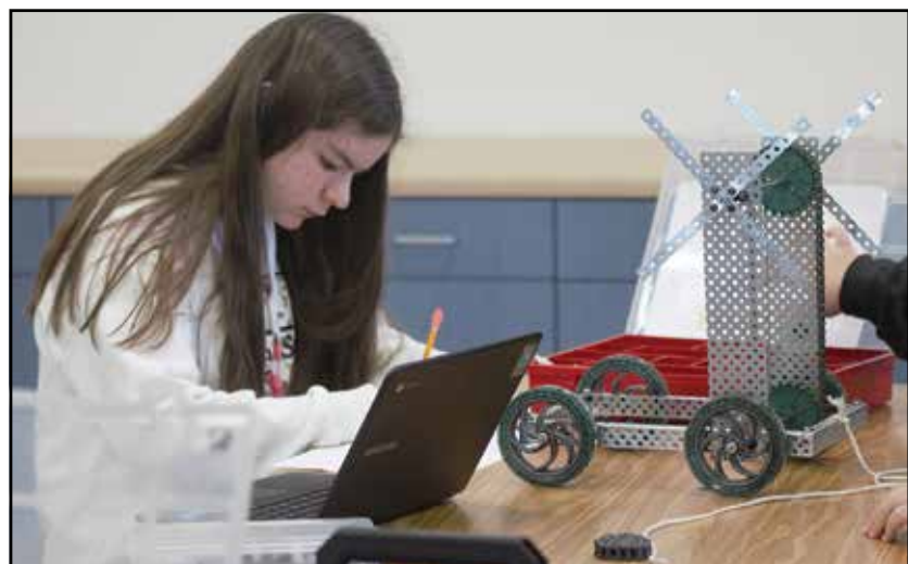
Research is done on the students' hypothesis before completing the projects.

For example, the first graders are currently learning about animal adaptations, with the students asking themselves why certain animals have different types of beaks, claws, and body make-up in which to eat. "We have them test what type of claws are better equipped to pick up food, how efficient they are in gathering the food, etc...." commented Cranfill. After testing the theories with tools, such as tweezers as a beak, or a spoon, and a clothespin, the students note their findings on what tool is most efficient in picking up food. "They have the opportunity to test their theories and then