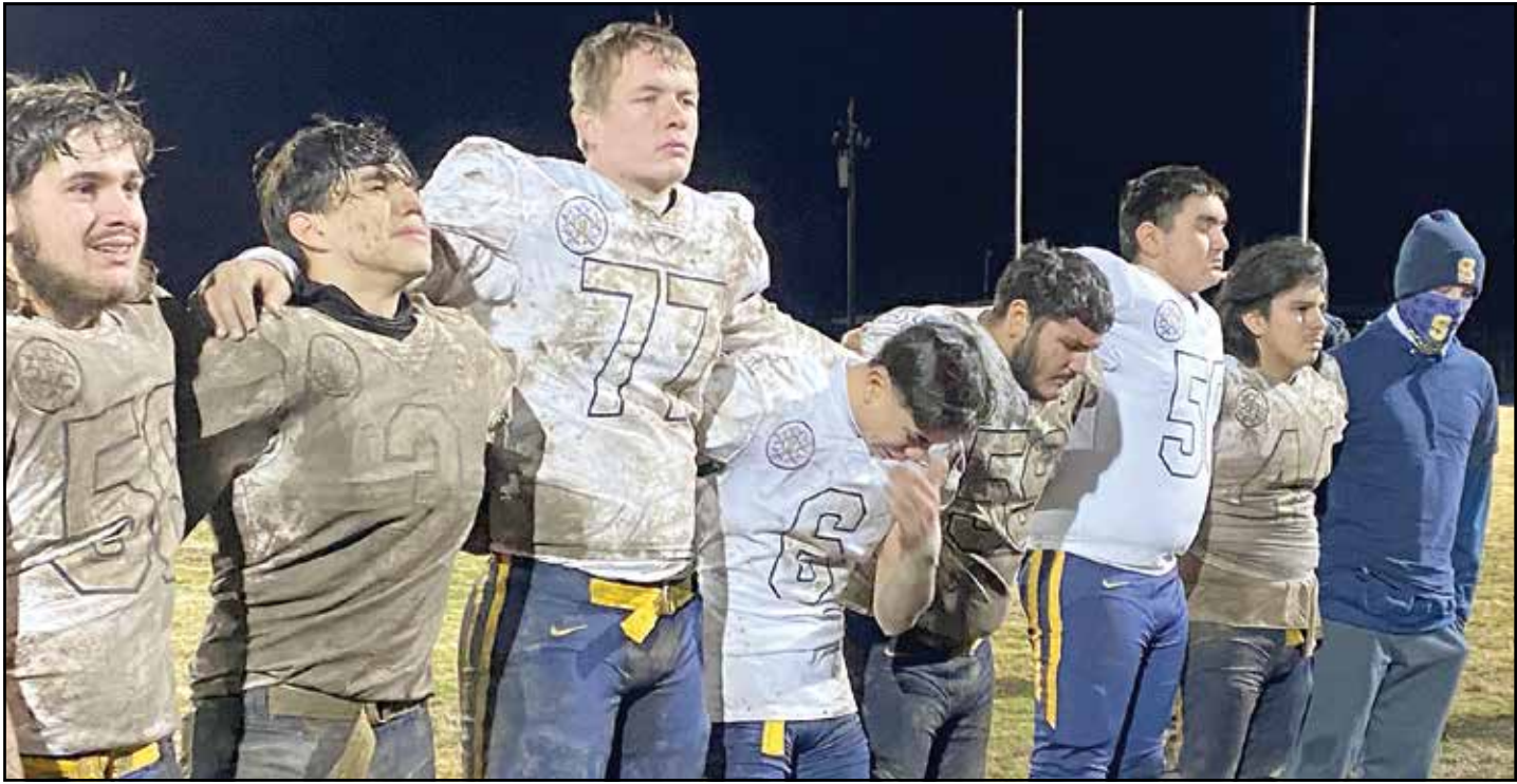
The Generals unite for one last Alma Mater after the game.