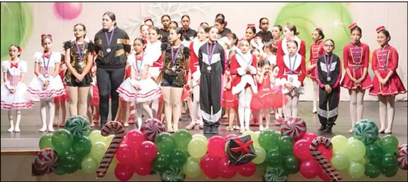
The 2022/2023 Planet Dance Studio award recipients.