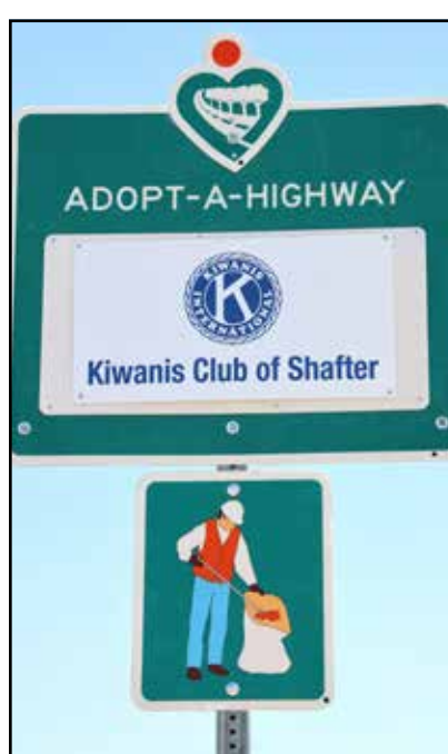
This sign is located along the stretch of Highway 43 between Fresno Avenue and Jack Avenue.

The Kiwanis Club in Shafter has their hands in a lot of things, from holding charity events, honoring students with their Terrific Kids program, as well as welcoming new teachers in the District with a special luncheon at the beginning of the school year. A sign is up in the area of the highway, naming the Shafter Kiwanis Club as the Adopter for this stretch of road.