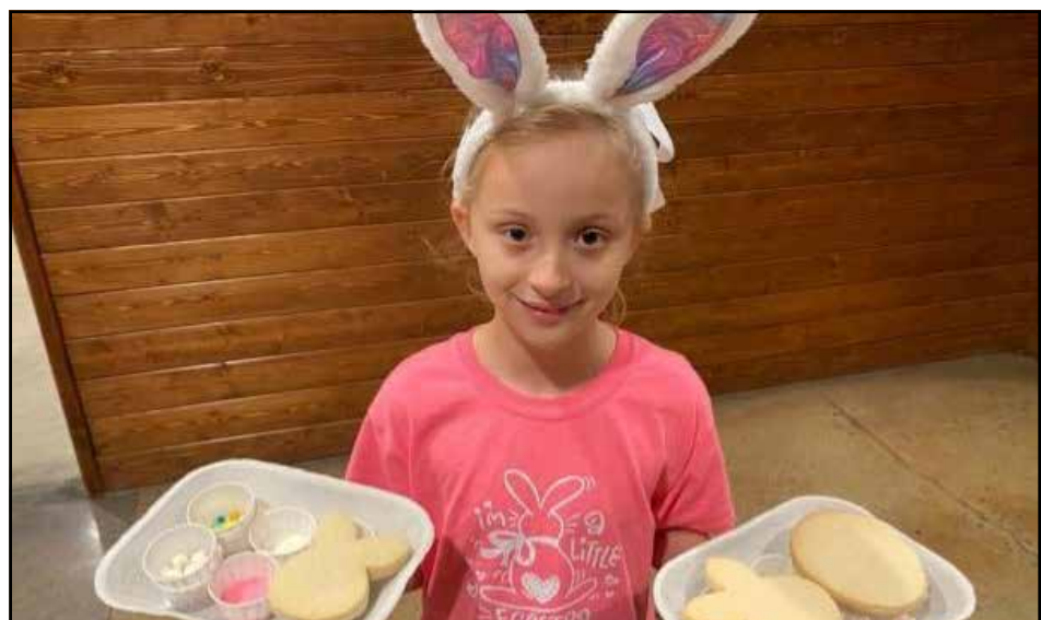
Each child received a cookie decorating kit to create their own masterpiece.

SHAFTER loved meeting the Easter Bunny and making their own cookies. I cant wait to get their cookies and display them at the house, if I can keep them from eating them." The event was just one of a number of great things that are happening at the local Ford Theater complex. The venue just recently hosted well-attended performances of the Broadway smash "Newsies", put on by the Shafter Young Adult Theater, as well as a very popular po-up event that drew over 50 vendors to the site, selling everything from clothing to beauty supplies and candles. Stay tuned as another, bigger pop-up event is on tap for late April, named Coffee and Creative. This event will have over 70 vendors in attendance, with the majority of them local entrepreneurs displaying their home business creations.