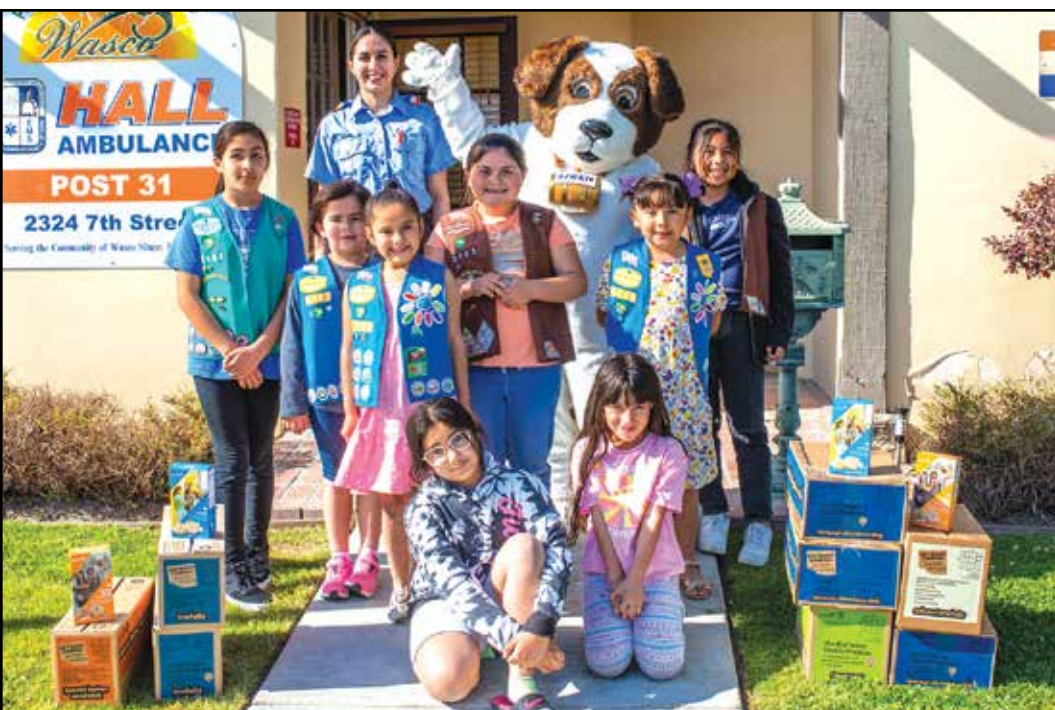
Troop 8163 with Siren the Rescue Dog. RIGHT: The girl scouts were thrilled to receive a Siren cuddle toy as appreciation for their donation.