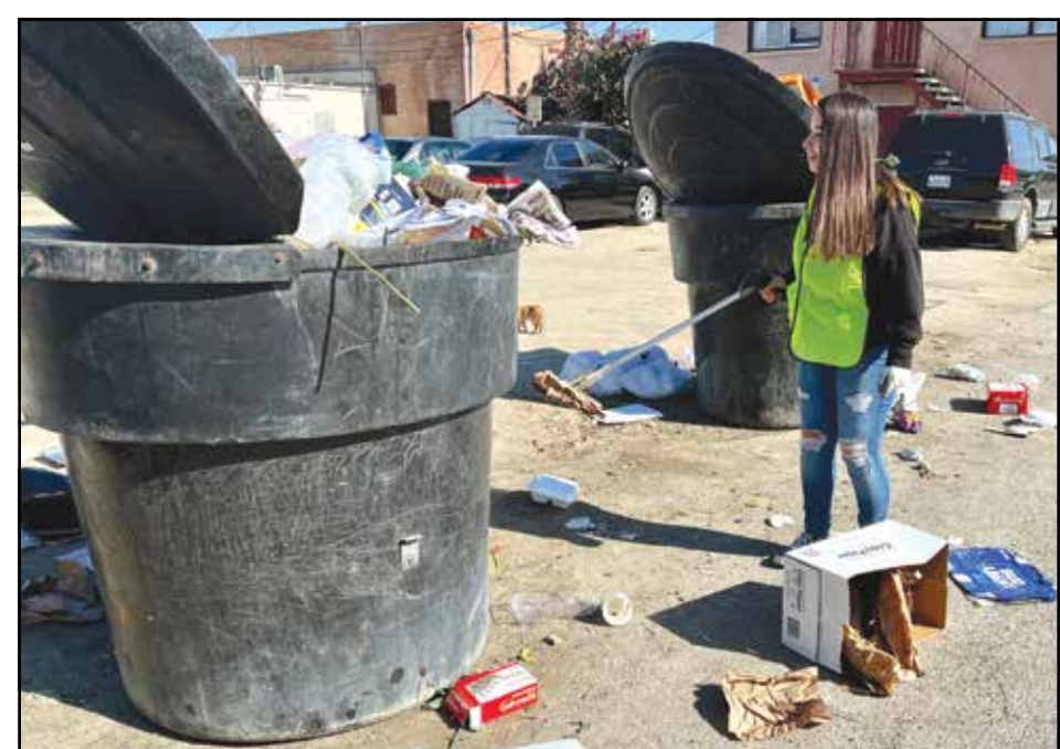
A volunteer cleans up trash from a messy alleyway at the event last year.

WASCO At the event, one can bring in old furniture, home appliances, TV's, mattresses, e-waste and water heaters. Trash, commercial waste, construction or remodeling scraps, hazardous materials and green waste cannot be accepted. For those who have no way to transport the waste, the city has a pick-up service where they will go to your residence. Code Compliance holds community clean-ups twice a year. These events are always busy, and last time there were 68 drop-offs and 45 pick-ups of large amounts of waste collected. Volunteers play a big role in the clean-up, and more are needed. "I will need adult chaperones to guide students on the alley clean-ups." The clean-up will occur from 9 am to 12 pm at Barker Park. For more information or to sign up to volunteer, call (661) 758-7213.