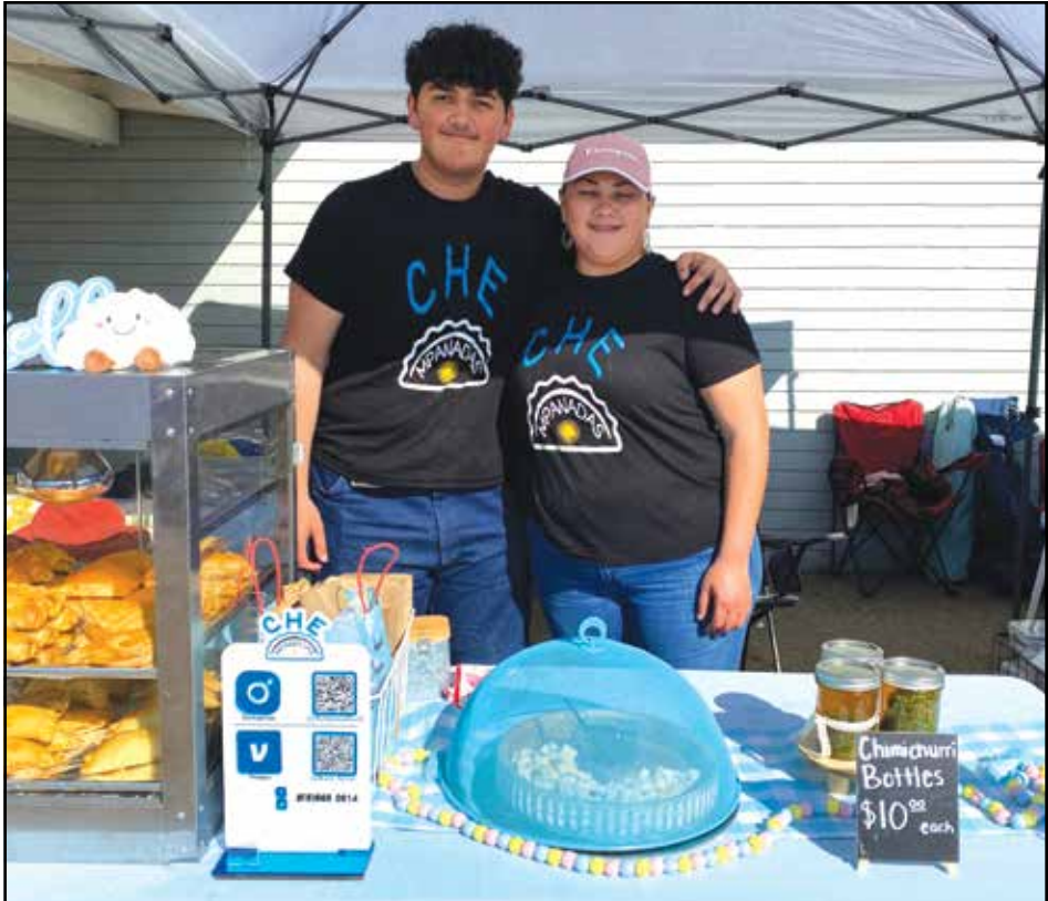
Che Mpanadas was a popular stop at the event.