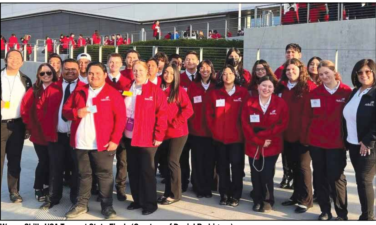
Wasco Skills USA Team at State Finals

people from different places." You can be part of this organization on the Wasco High School campus, by joining any CTE class such as multimedia, culinary arts, public safety and allied health. For more information you can email Daeusebio@wascohhsd.org or Jemercado@wascohhsd.org. You can also follow them on instagram at Wasco SkillsUSA.