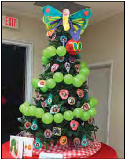
North Kern Christian School displayed their tree during the Toys for Tigers event.