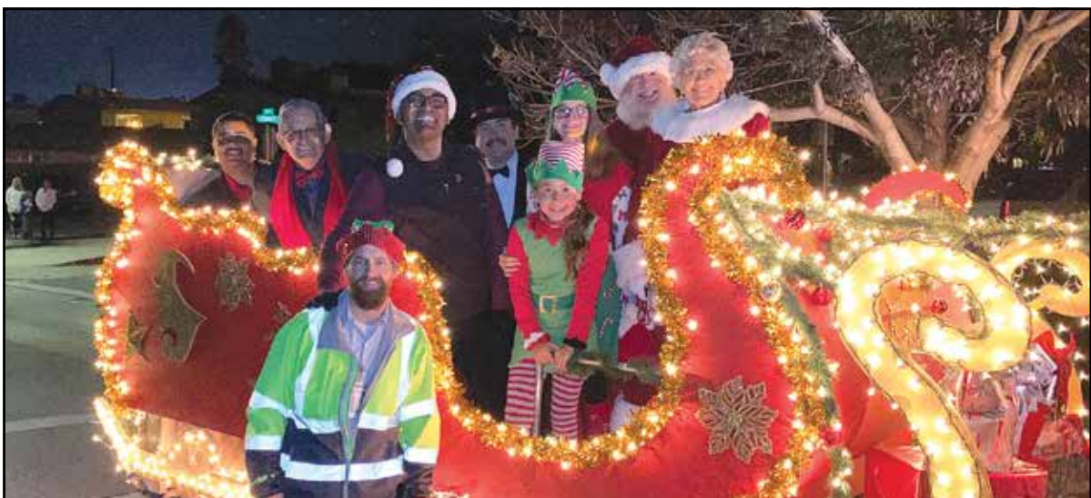
Lighting up the holidays

The City of Wasco float in last week's was a lit carriage filled with council members, Mr. and Mrs. Claus and some elves. FULL PAGE OF PICTURES ON PAGE 3.