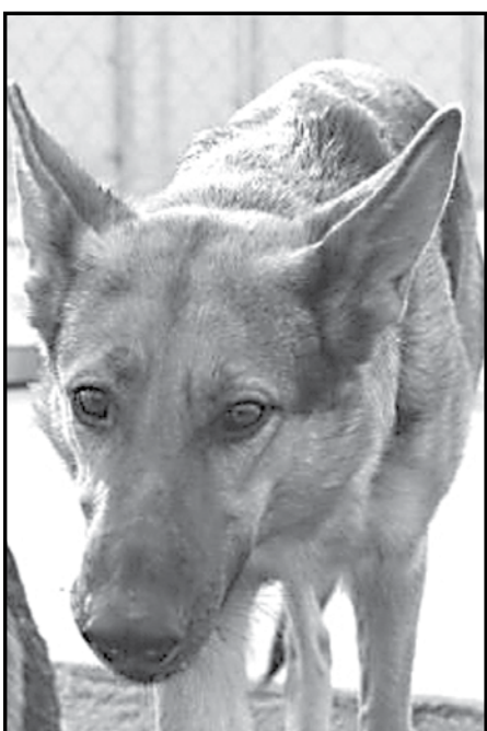
Barbie is about 2 years old.