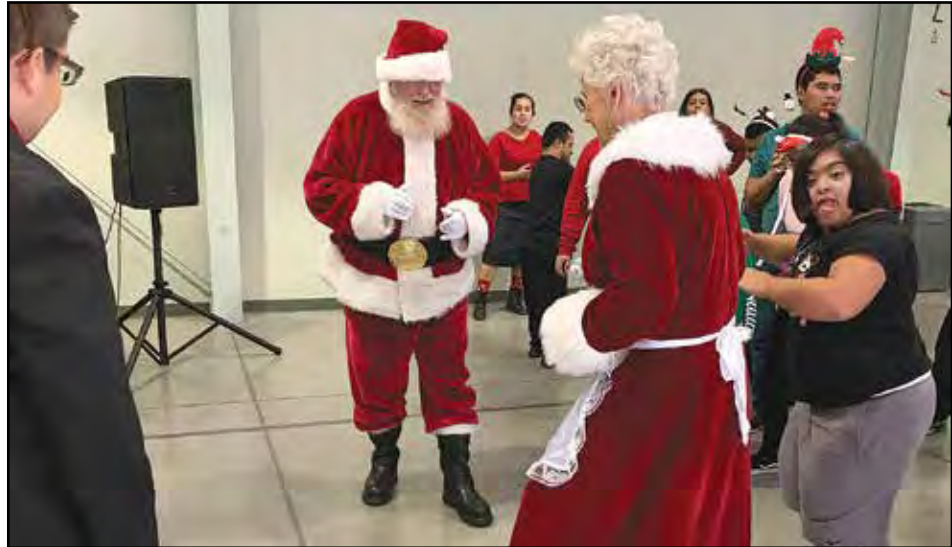
Mr. and Mrs. Claus joined in the dancing.