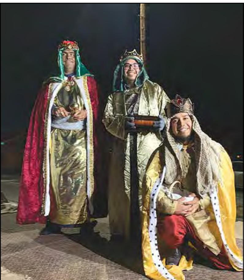
Also part of the nativity is the Three Wise Men, also displayed by St. John's Catholic Church.