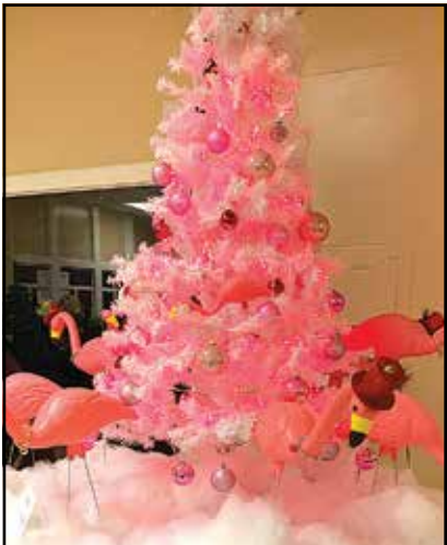
A flock of flamingos was displayed on the Toys for Tigers tree.