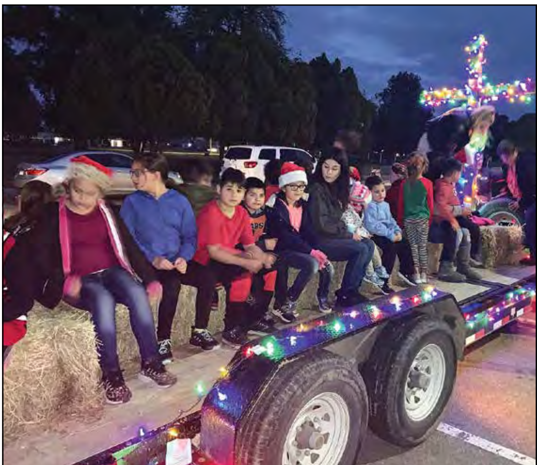
The Grace Community Church Kidz Zone's float.