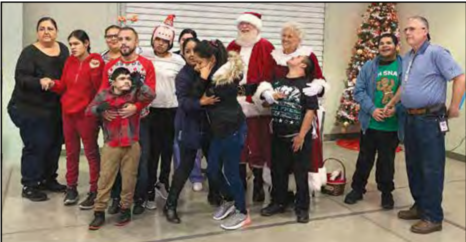
Another group of students at the party.

With a donation from Wasco State Prison, the Woman's Club provided a gift specially chosen for