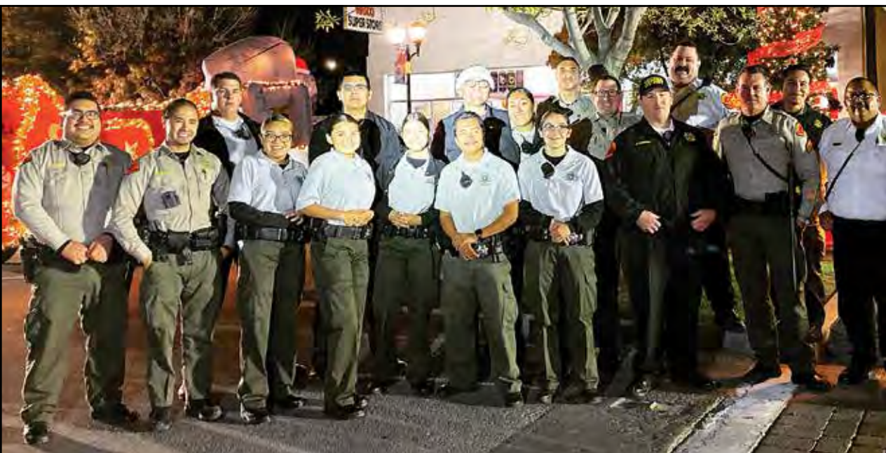
Enjoying the parade were the KCSO deputies, the Sergeant and KCSO Explorers.