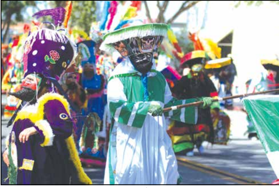
The Cinco de Mayo Parade returned to Shafter in May.