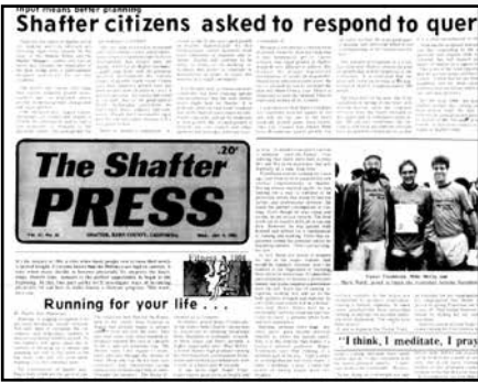
The front page, Jan. 4, 1984