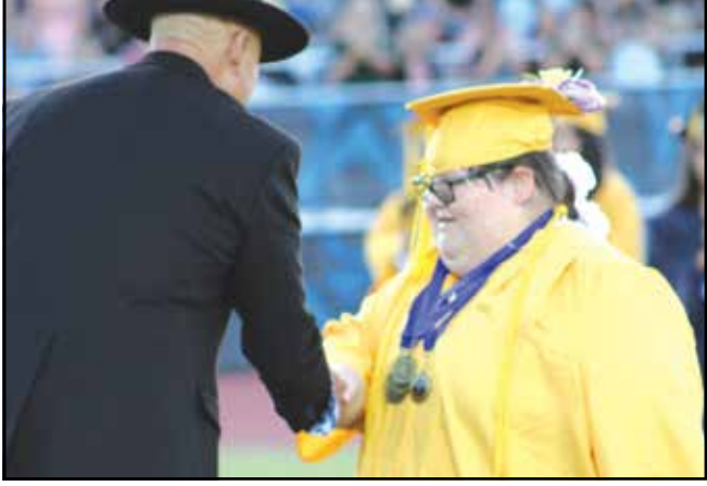
The Richland Trojans walk across the stage one final time as junior highers.