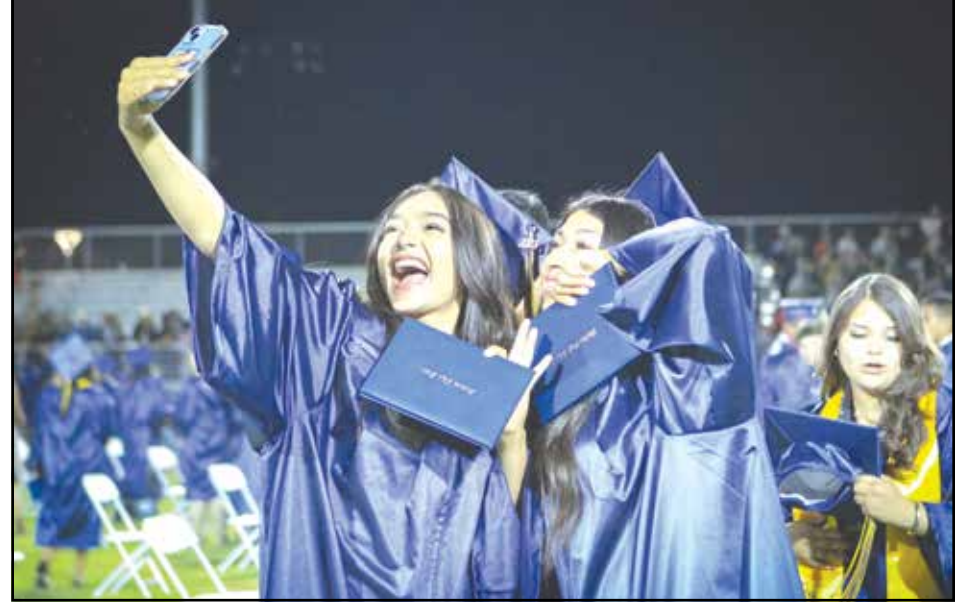
SHS seniors celebrate their last night as high schoolers.