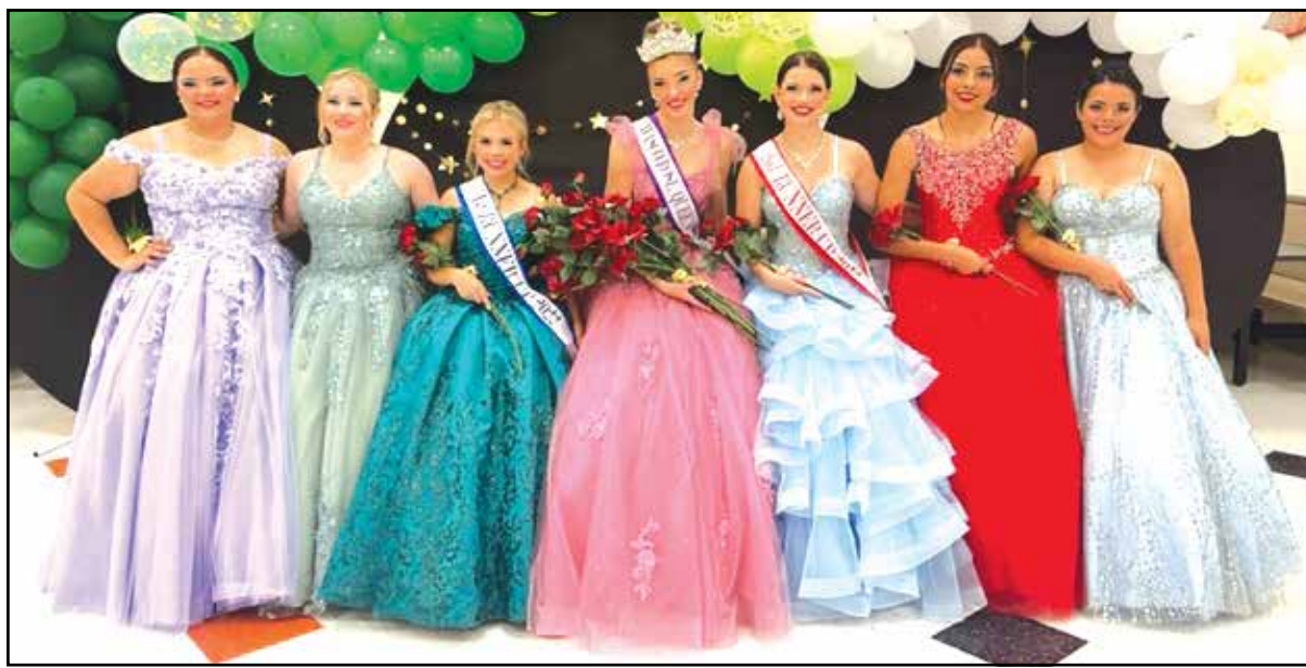
The girls looked stunning in their formal gowns.