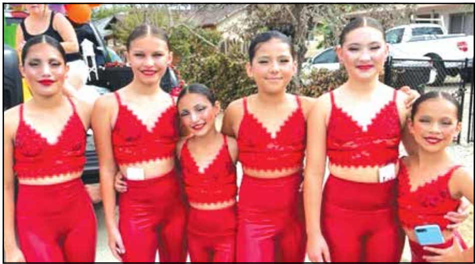
Planet Dance Studio had a great waving to the crowd and performing their routine.