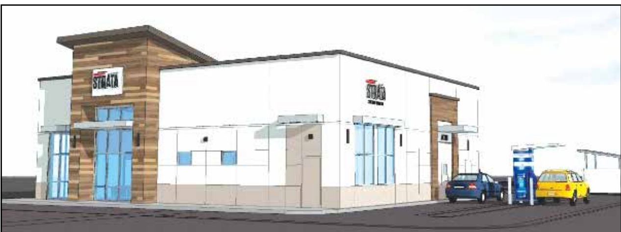
An exterior rendering design of the Strata Credit Union building opening the Walmart shopping center.