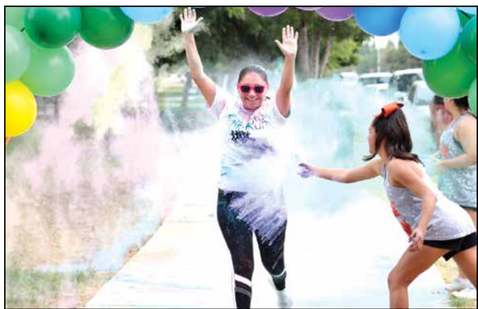
The volunteer cheer team sprayed the runners with colorful powder.

the community together, especially with everything going on; people need to be more united."