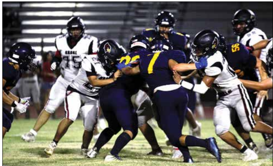
The Generals' defense had an outstanding game.