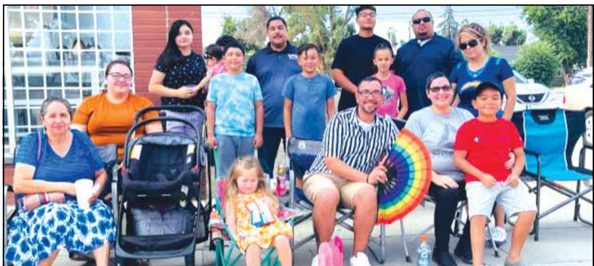
Crowds lined the streets at the parade.