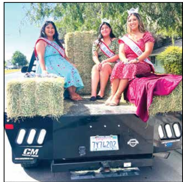
In the cars/trucks division, 2nd place was awarded to the Ms. United State Agriculture Queens.

for those that attended the Rose Festival.